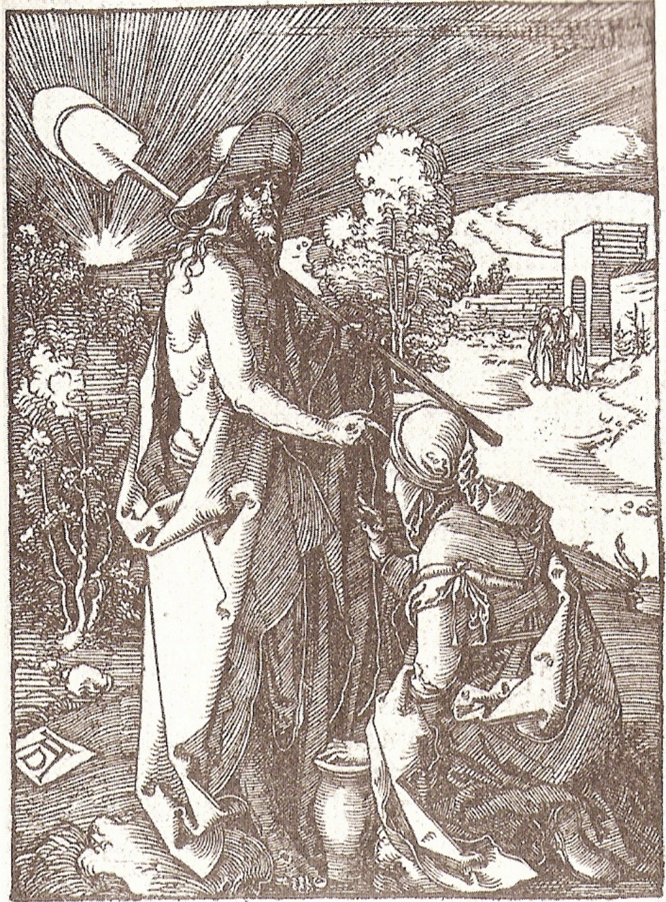
Fig. 2. Albrecht Dürer, thirty-second block in the woodcut The Small Passion .