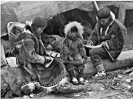
A Inuit Family.

The first building blocks in the establishment of legal families, emerges with the first meeting between social workers and potential adopters. Through the case-work approach, social workers seek to ascertain whether applicants have any prior knowledge or understanding of child development. It is important that all potential adopters demonstrate their understanding of children's needs as they grow and develop. Hence, they are required to gain and engage with attachment theory.