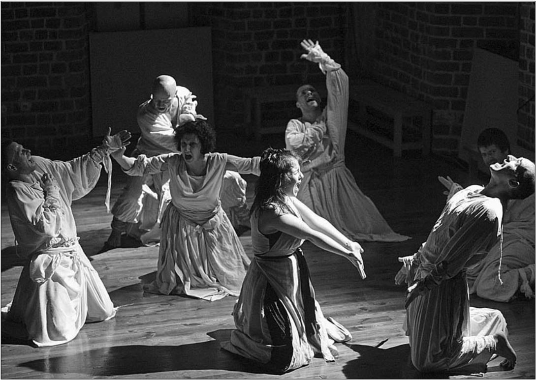
Lamentations in Lacrimosa .

tioners understand this, because it comes with the understanding of the practice: if you name something, if you give a simple definition to something, you stop the process. You close the experience. In the moment of naming something, the process is over. You have to start another one. If you name something an 'impulse', you've actually lost it. If you focus on something that is an impulse, in that very moment you've lost it. So, in order to follow something that you call 'impulse', you must, in a way, not recognize it. There is something like a 'way' that feeds the impulses and, as Anna says, she has to recognize her own way. If she recognizes her own way, then the way that Stanislavsky would call the 'internal monologue' is composed of millions and billions of impulses that you must never focus on.