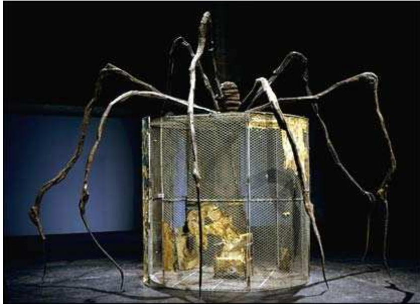
Louise Bourgeois, Spider , 1997, steel and mixed media