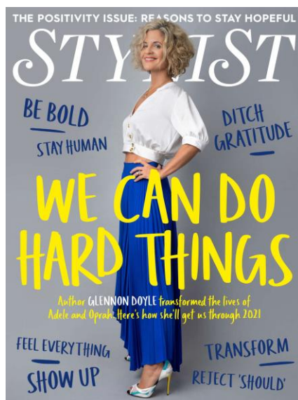
Image 1. Stylist Positivity Issue cover, January 2021