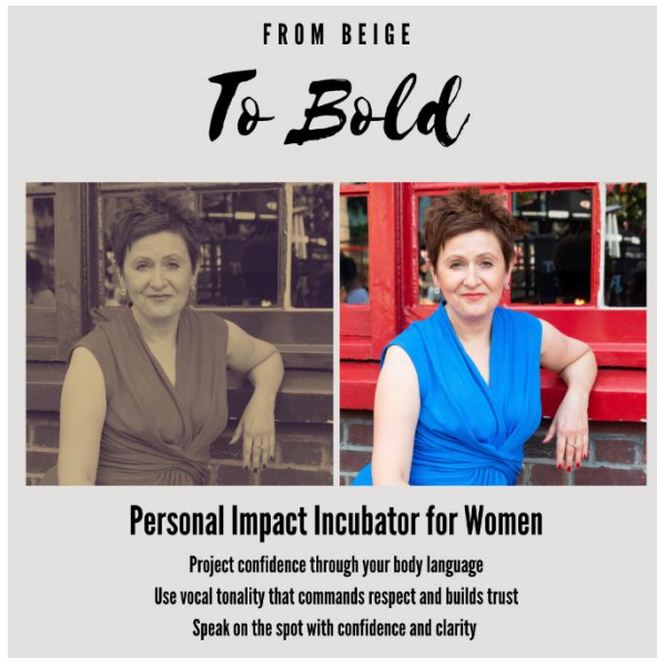
Image 3. “From beige to bold,” posted by Gosia Syta on LinkedIn.

feeling throughout the pandemic – to a colourful, vibrant, optimistic and forward-looking mode. The memes tell the female viewer: you, and you alone, can make the image on the left a thing of the past (just like old sepia photos) and transform yourself into the kind of brighter, glossier, confident and full-of-hope subject on the right.