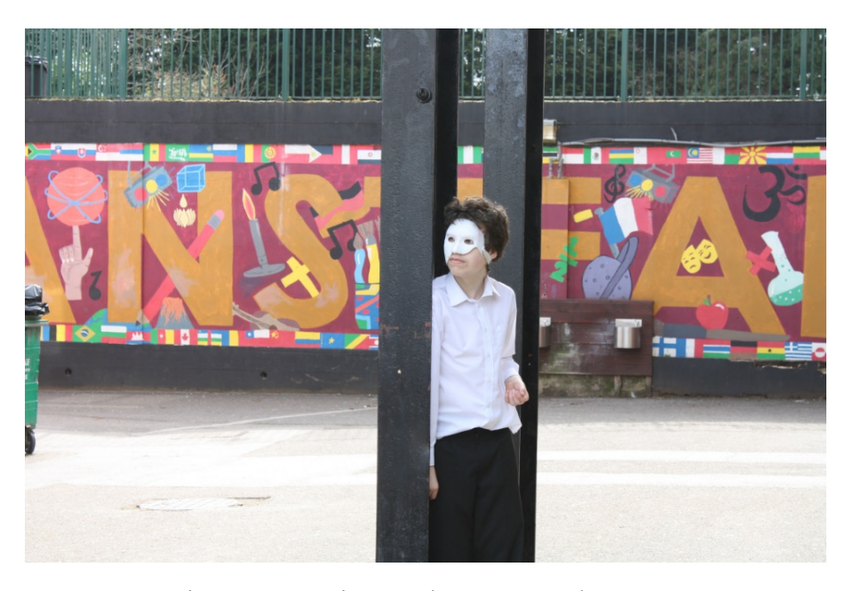
Figure 2: Wearing masks to create characters

The digital story, Inside the Asylum , was created by a small group of 13–14-year-olds within their mainstream English class. These students were working towards the first Critical Connections Film Festival (2013) under the theme of 'Inside Out'. The digital storytelling project enabled these young students to tackle the subject of mental illness and the students explored the idea of a character trapped in his own mind. Drama was integral in the process of moving from storyboarding to enactment of the scenario as the students decided to create white masks for all the characters (Figure 2) and tell their story through movement, action, and the repeated word 'bored' written across a blank page and final word 'escape'. The young filmmakers wanted to touch on themes of mental illness, imprisonment and the unknown and wearing masks made them think deeply about how they could act out their story. The film educator supported the students with their use of cameras, tripods and sound enabling them to experiment with high and low angle shots and capture critical moments in the story. The English teacher encouraged students to think about how they could tell stories for a multilingual audience (Macleroy, 2016).