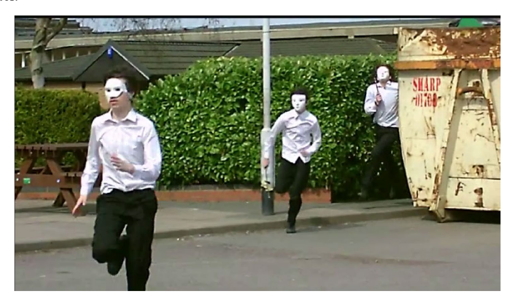
Figure 4: Acting with masks in Inside the Asylum

How did the young participants use drama in the production stage to bring their stories to the screen and convey a meaningful message to young multilingual audiences across the world? In the first digital story, Inside the Asylum , the young participants decided to produce a silent film and so their story had to be presented through their movements and actions. These students took their filming outside and looked for gates, doors, walls, and barriers that could be used to show the character imprisoned. The protagonist was filmed holding the bars of a large green padlocked gate looking sideways for a way out. These students used dramatic pauses and moments in the film to build the tension and sought out different locations around the school grounds to act out the chase scene. All the students had to learn how to act with masks, face the camera, and represent shifting emotions with movements and gestures rather than facial expressions. The young filmmakers needed to repeat their actions, practise the chase, and think very carefully about different camera angles and shots to represent the inner feelings of the character.