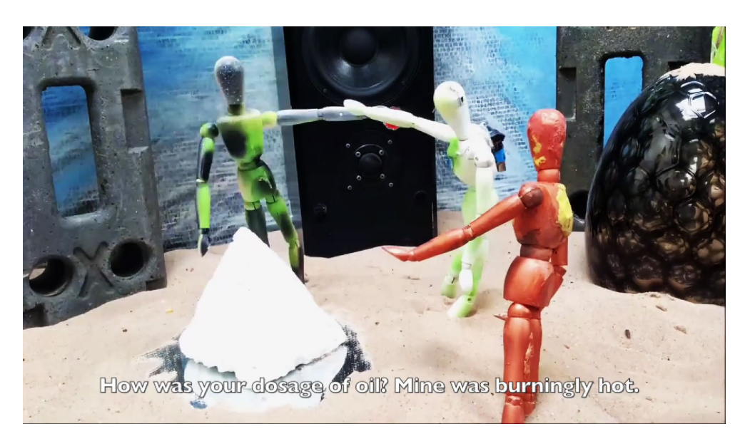
Figure 5: Producing the digital story, The B.A.D. Robot

In the third digital story, The B.A.D. Robot , improvising and using dramatic techniques were integral to producing the animation. These young participants created a mood board to explore settings for the digital story and then created a film set in the art classroom. They had to experiment with lighting, making the robots stand up, and animating the robots to interact in meaningful ways. These students learnt how to create a film set using found materials such as concrete blocks, film paper, canvas frames, old boxes, and an old blue painting. The robots were created out of art materials, electronic junk, and computer parts. These young filmmakers were finding it challenging to balance and move the robots to act out the story and moved outside to look for a solution. The breakthrough in the production process came when they decided to use the sand pit and placed concrete blocks in the sand to create the set with a blue backdrop (Figure 5).