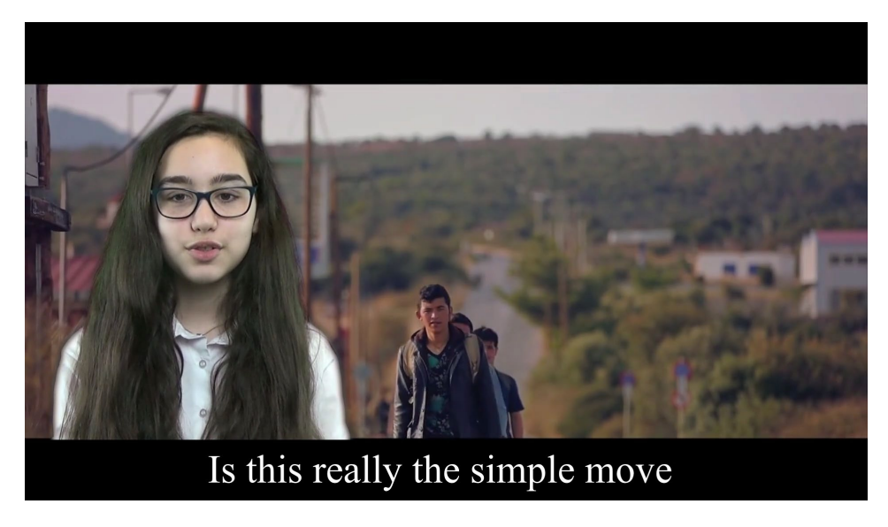
Figure 6: Post-production and using Green Screen

In the post-production stage of the third digital story, The B.A.D. Robot , the young filmmakers experiment with the dramatic effect of using different languages and accents for the voice-over of the robotic characters. The editing process is complex, and the young filmmakers are working with three languages and developing their use of English in the process. These students decide the old robot character would speak in Hungarian, the newer androids in Portuguese, and the narration and subtitles would be in English. In this editing stage, the young filmmakers use images from their mood board to set the scene in 2124; a back story to develop the dramatic narrative as the robot has been deactivated for 100 years; and electronic music and sounds as the robot is reactivated by solar energy. The students use their languages and voices in versatile and playful ways to create dramatic tension in their story and show how the main character is excluded and made to feel threatened, unwanted, and odd due to his age, shape, language, and voice. The young filmmakers present a critical and creative perspective on belonging and edit the story to have a sad ending with the old robot humiliated and rejected and deciding to deactivate himself to wait for a better world.