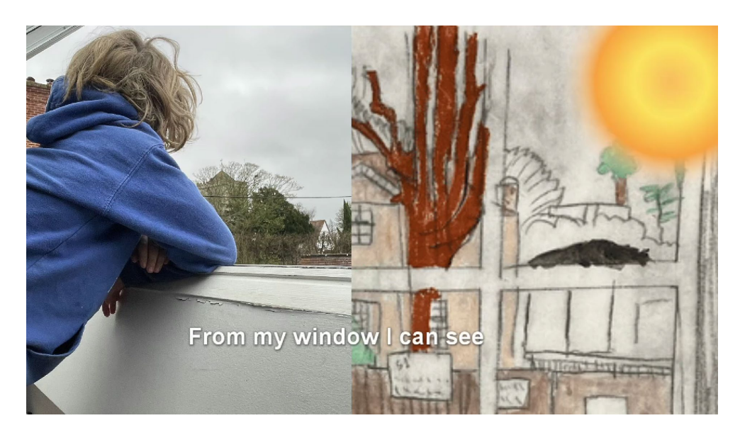
Figure 7: Post-production in From my Window - De ma Fenêtre

In the post-production stage across these four schools, the young filmmakers learn how to develop dramatic tension through shifting emotions and mood; changing colours, images and special effects; and experimenting with languages, voice and music in their digital stories.