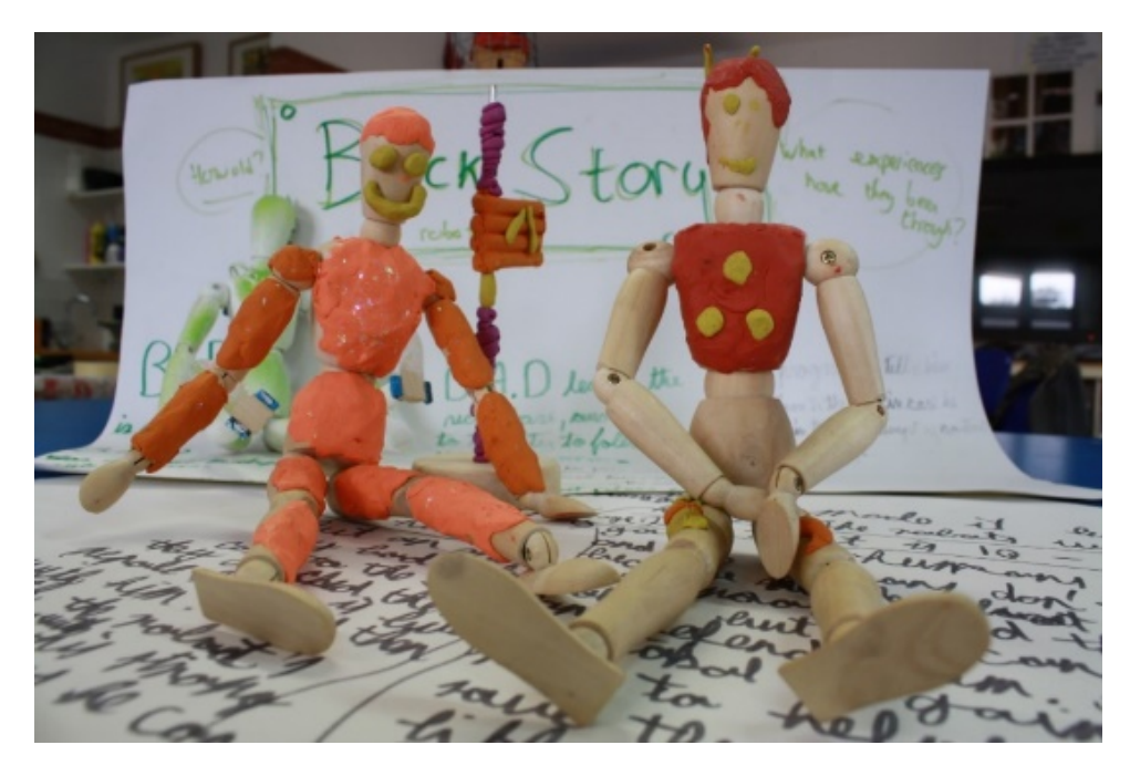
Figure 3: Back Story for The B.A.D. Robot