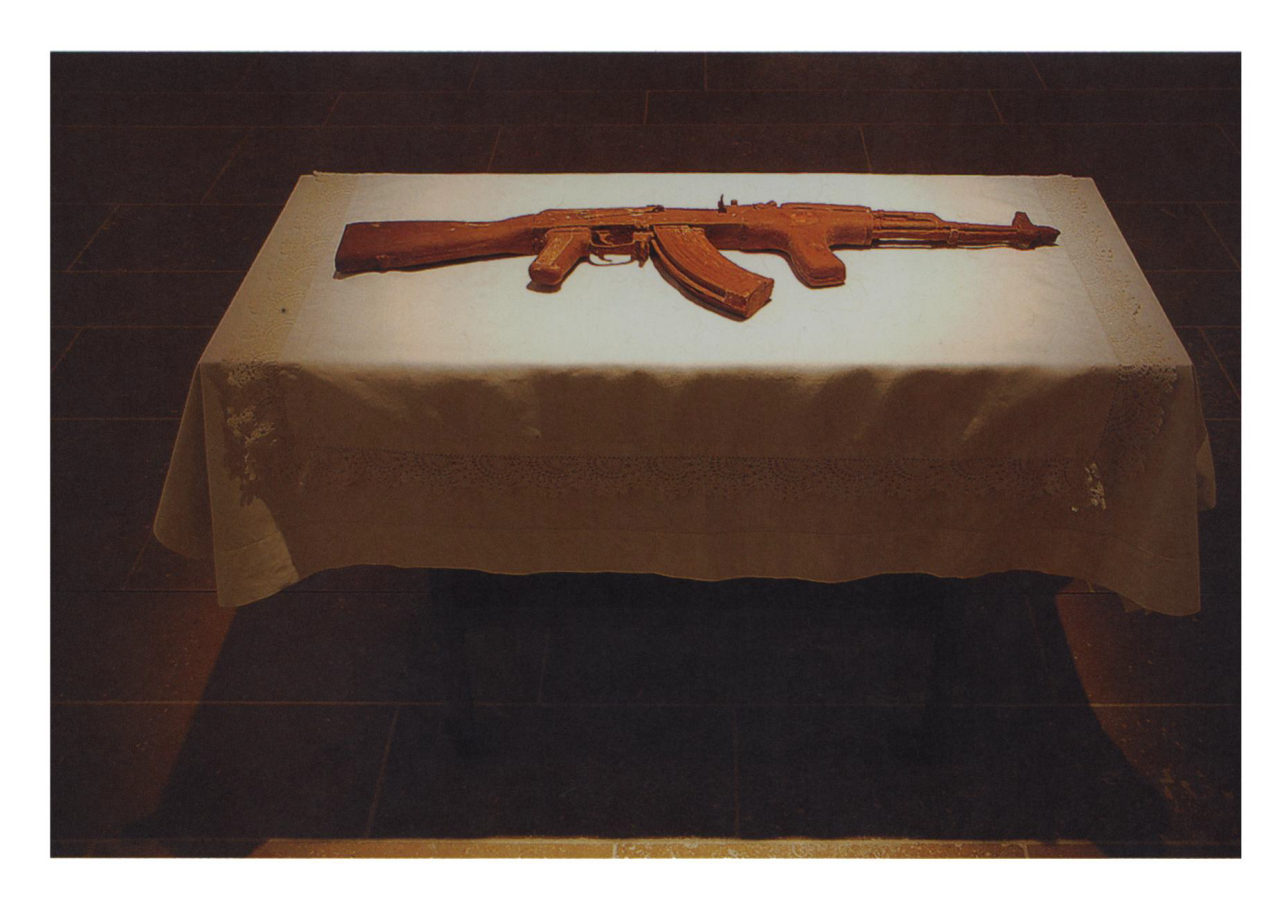
Fig. 8. Rita Duffy, Dessert , Chocolate AK47 on linen with lace, 2001. Reproduced by kind permission of the artist.<sup>60</sup>

Dessert arrives, a few short years after the Good Friday Agreement, against a background of negotiations around the verified disposal of illegally-held weapons – an issue still threatening to derail the peace process. <sup>61</sup> Laid out on the lace-rimmed linen that routinely dresses Christian altars, this chocolate gun exudes religious ritual and Benjaminian aura. <sup>62</sup> But as a piece of confectionary, it also emits the opposite: it is a homely gun – deliciously indulgent. In this paradoxical concoction, gender, race, religion and nation cohere, for Duffy, in a mythical product in which fantasy is inextricable from exploitation: