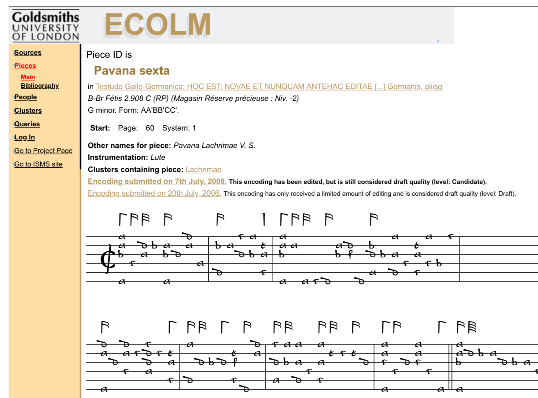
The ECOLM interface as it appears today.

“Electronic Corpus of Lute Music”, a series of projects (1999-2006 and 2012) to make a database of lute tablature encodings with metadata, for scholarly use, queried using a web interface. The resulting database was hosted at Goldsmiths, University of London, and is still running today, although nobody is formally responsible for maintaining it.