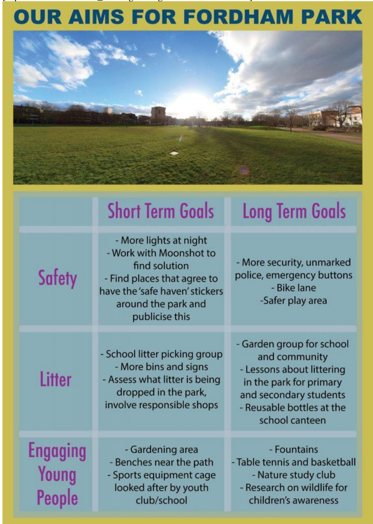
A poster of all the goals the students devised.[/caption]