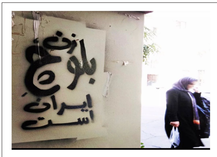
Figure 3. Graffiti stating, 'Women, the Baluch of Iran'.