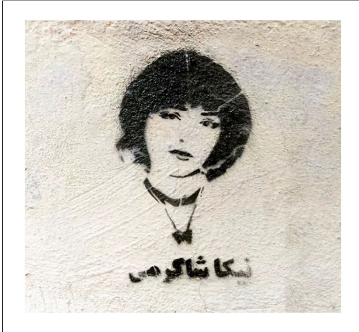
Figure 4. Graffiti commemorating the 16-year-old protestor, Nika Shakarami, who was killed by the Islamic Republic's security forces in September 2022.