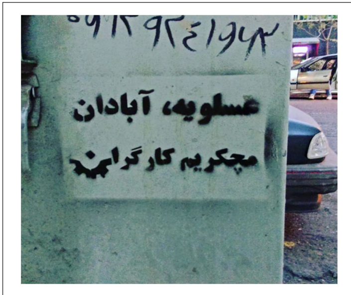
Figure 5. Graffiti stating, 'Asaluyeh, Abadan, thank you workers'.