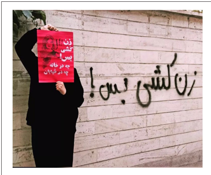
Figure 2. Woman holds up poster stating 'Enough Femicide! Whether in the home or in the street!'

Source. Khiaban Tribune, Instagram , 25 November 2022.