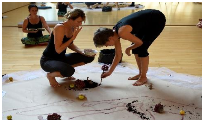
Marking the co-created bodyscape