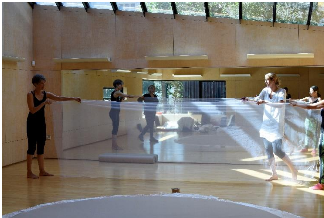
Preparing the ground