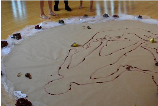
Tracing each other