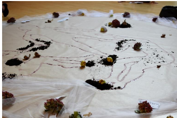
Honouring our bodies