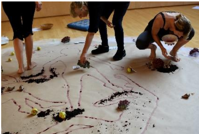
Exploring and playing