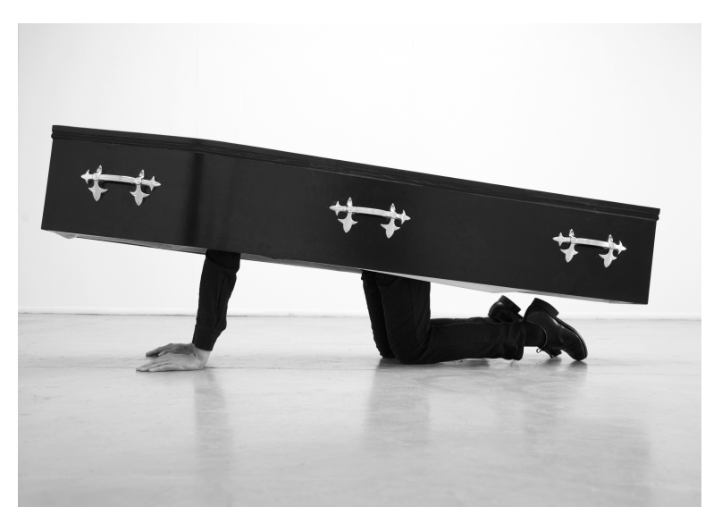
Figure 1.1 Martin O'Brien, The Last Breath Society (2021). Institute for Contemporary Art, London.