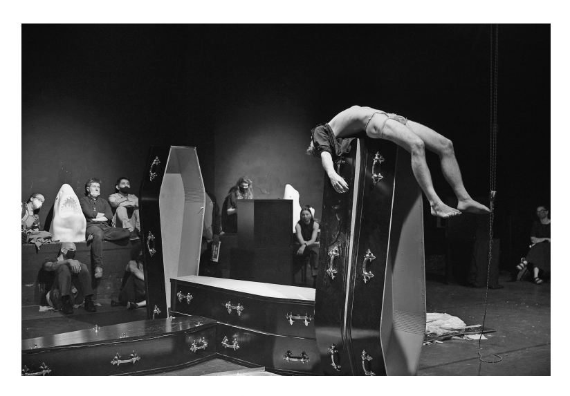
Figure 1.2 Martin O'Brien, The Last Breath Society (2021). Institute for Contemporary Art, London.