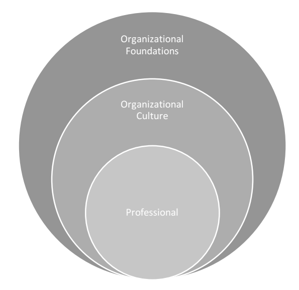
Figure 1: Layers of Hospice and Palliative Care Settings