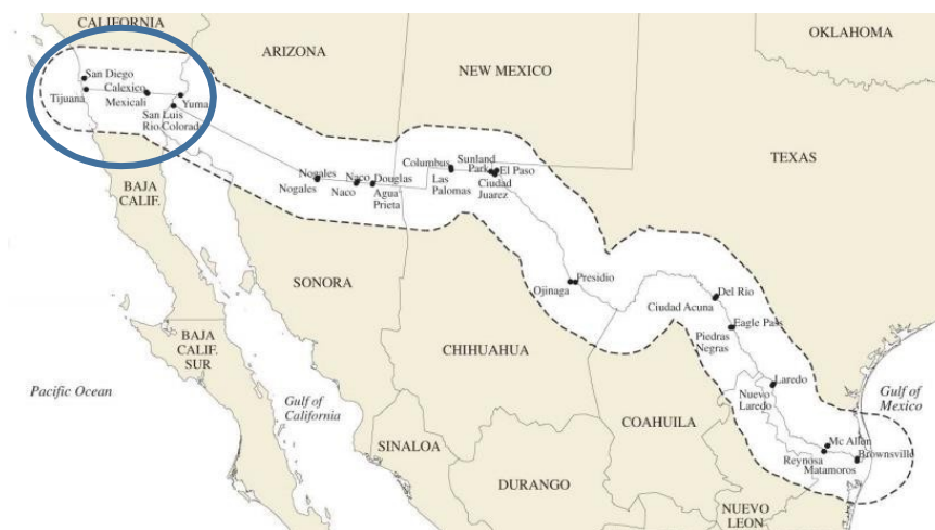
Map 1. Cali-Baja Transborder region. The territory circled shows the Cali-Baja region and the set of twin cities Mexicali-Calexico and Tijuana-San Diego. The transborder region along the Mexico-U.S. border is shown within the dotted lines.

As stated previously, daily practices and challenges should inform further theorisation of transborderism and its policy implications. To clarify, pupils are young learners in pre-college education, and students are young adults in higher education. The term learners in this research encompasses both demographic population, pupils, and students. In this context, it is essential to understand the complexities of the figure of a transborder pupil and student. For instance, they cross the Mexico-U.S. border for academic purposes twice a day in most cases. In other words, they live on the Mexican side and cross the border back and forth to attend school in the U.S., or vice versa. Some of them began a transborder journey at the age of five or six years old, and others became transborder at a later stage. They partake in such a dynamic by holding a passport or a student visa. Many of them cross the border as unaccompanied minors which is highly problematic due to safeguarding implications that will be discussed further in this research.