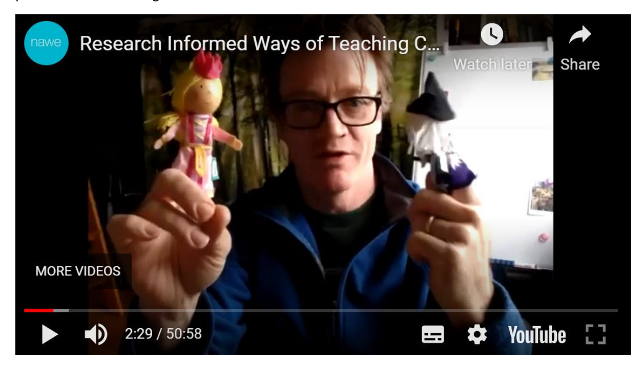
Figure 1 My inner princess meets the online wizard who will solve all my problems.

At the beginning of my NAWE workshop, I used puppets to tell a story which illustrated my key points about teaching online. I cannot pretend to be expert puppeteer or storyteller, but I offered my show in the spirit of playfulness. In Figure 1 you can see my 'inner princess' – the person in me who desires to be perfect – meeting the magic wizard who the princess wants to solve all her problems with teaching online.