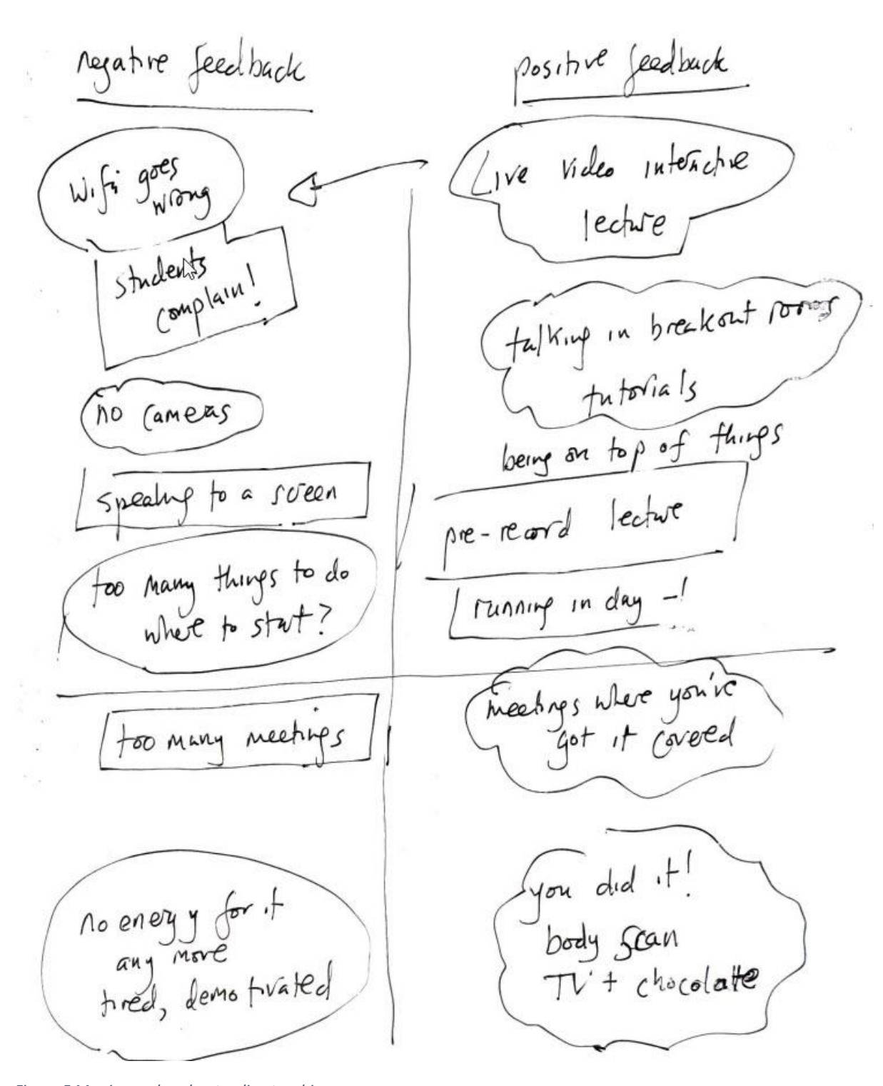
Figure 5 My circumplex about online teaching

You can see that 'high arousal' and pleasure in me is generated by positive student feedback, but high arousal 'displeasure' by negative feedback. Both generate a great deal of energy, but in different ways. So, the thing here is to consider how best to use this energy. I argue that as an online teacher you must take a 'Growth Mindset' approach (Dweck 2014) to online teaching as opposed to a 'Fixed Mindset'. The two approaches are outlined in the following table: