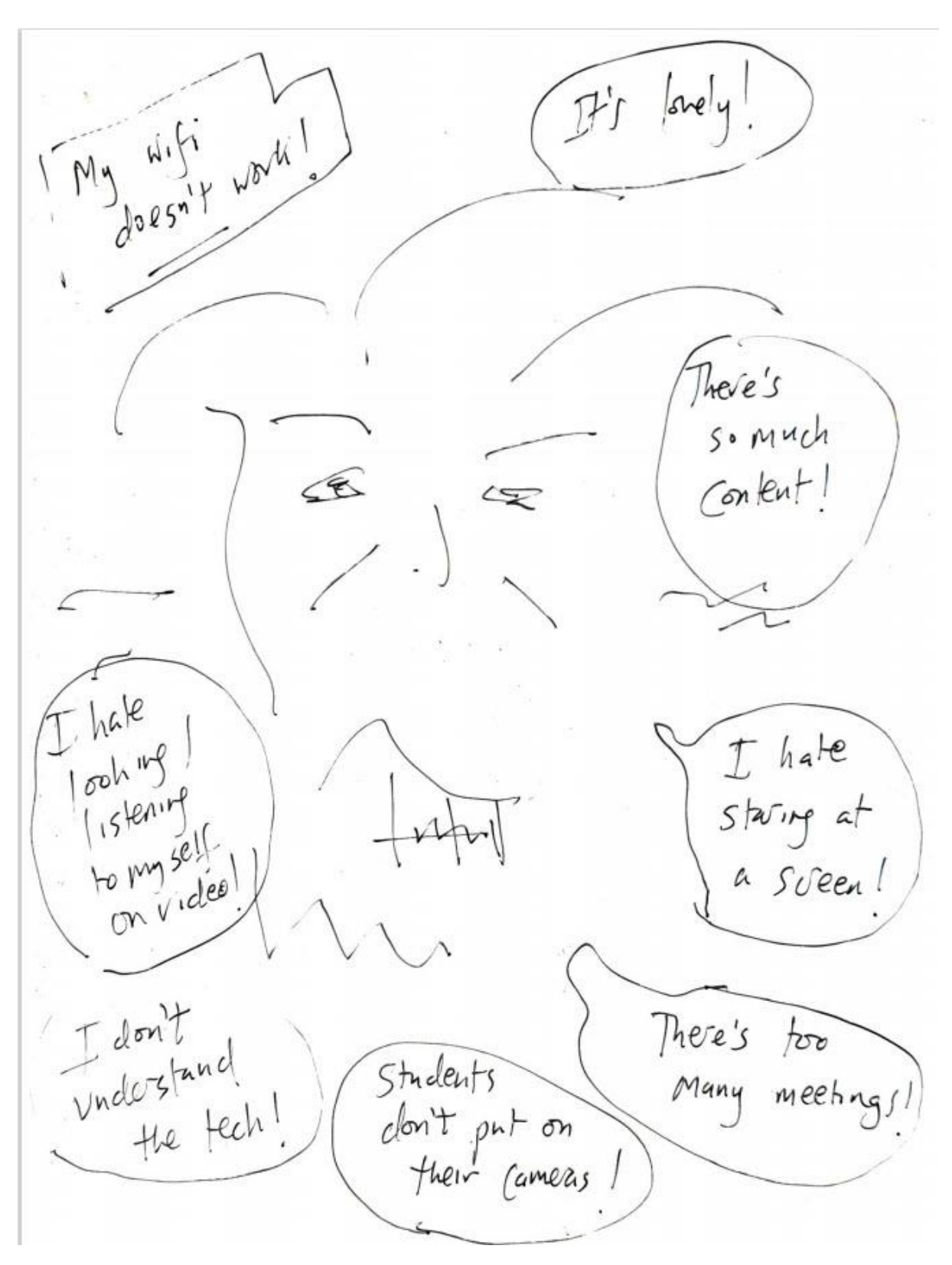
Figure 3 Venting drawing by the author

experiences. Such a journal should be professional in focus but also deeply personal (Bolton 2006). It should be full of things like 'venting'. Figure 3 illustrates what venting involves.