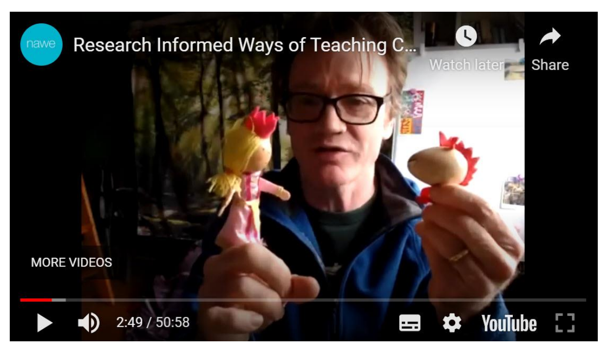
Figure 2 The princess meets her inner demons

Sadly, the wizard disappears and my inner princess falls down the 'learning pit': the place where learners get stuck. There, she meets a devil, who represents her doubts.