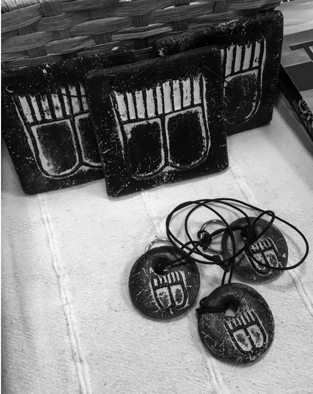
Figure 8. Activist merchandise featuring the engravings.

Hundreds of years ago, the Maho people fell in love with a mountain. Its colour, its remarkable shape, its location in the landscape, the way it sees off the sun each day ... it all caught the attention of the indigenous population, who chose it as the place to look for answers and find hope. They took care of it, revered it; they tattooed hundreds of feet on its skin. And they gave it a name: Tindaya ... [The powers that be] have perverted the law, unprotected its value, ignored its history and its incomparable heritage. But they haven't been able to silence the voices that defend it; Tindaya's history is the history of a proud and conscious people who will not capitulate before the power of money and ignorance ... This is why we are here, and will continue to be until we achieve the complete protection of the mountain, until we have absolute certainty that future generations will be able to learn from and admire the beauty of a mountain that speaks to us with its [engraved] feet, its greatness and its placid gaze towards the horizon. And we will not be moved until the establishment acknowledges what the people already know: that the monument already exists! [ general applause ]