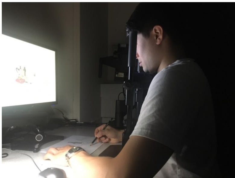
Figure 2. Experimental flowchart of the representational drawing task trial 1 (top) and the experimental set-up (bottom).