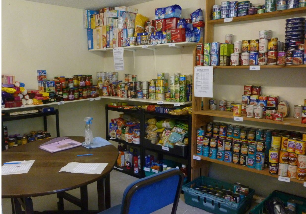
Fig. 6. Interior of food bank in west Wales.