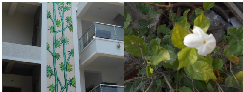
Image (left): a painted wall from a new construction site, just opposite to her home... Sujatha vividly spoke about her liking of modern buildings and the modern appeal of the city.

Describing her photography (see below) she told us that she was happy that she lived in a big city: she found the experience of living in a city, amidst tall, exquisite buildings, fascinating. In the city, her sense was one of modernity, unlike in her village.