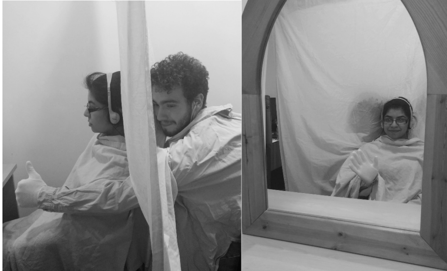
Figure 1. Left: side view of the experimental setup. Right: participant's view of the experimental setup. Note that the arm and fist in picture belong to the experimenter that is sitting behind the participant, hidden by the curtain. This picture is taken from Cioffi et al. (2016).

Sixteen instructions for unimanual actions were played through the headphones (e.g., “raise your hand,” “point at the mirror”, “point at yourself with the thumb”). The experimenter performed the gesture immediately after each action instruction played. Each trial, lasting between eight and ten seconds, consisted of one action instruction plus a gesture. A three second break was given between trials to prevent carryover effects. In order to increase the effects of this manipulation, the 16 instruction-action trials were repeated 3 times in the same order without interruption. This was performed for each condition (match/mismatch; see below) and for each hand (left/right).