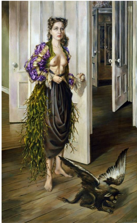
Figure 1: Birthday , by Dorothea Tanning, Oil on canvas, 40 1/4 x 25 1/2 in, 1942.

I had been struck, one day, by a fascinating array of doors –hall, kitchen, bathroom, studio– crowded together, soliciting my attention with their antic planes, light, shadows, imminent openings and shuttings. From there it was an easy leap to a dream of countless doors. Oh, there was perspective, trapped in my own room! Perhaps in a way it was a talisman for the things that were happening, an iteration of quiet event, line densities wrought in a crystal paperweight of time where nothing was expected to appear except the finished canvas and, later, a few snowflakes, for the season was Christmas 1942, and Max was my Christmas present (Tanning, 2001, p.63).