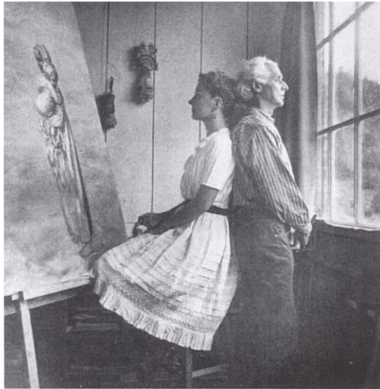
Figure 2: Max Ernst and Dorothea Tanning, Sedona, Arizona, 1946.

This photograph of Tanning and Ernst in their home, in the middle of the Arizona desert, represents for me much of what I have been discussing in this chapter. In that house, isolated and living miles away from anyone else, Tanning and Ernst stand back to back. His gaze is directed at the outside world. Hers, her body turned towards the inside, looks at one of her paintings, which depicts an image of motherhood, one of the most traditional and essentialising archetypes of female experience. Their positions, the way their bodies are oriented in that space, stands as a metaphor of their roles in the world. He, relying on her support, the strength of her back, kept rising as a famous artist. She, through her proximity to him, came to embody domestic femininities, but also felt sustained by him to go on being an artist. Drawing on Tanning's memoirs in this chapter I have explored how she crafted her textual self. I argued that from the moment Ernst entered her personal space, he changed it and she assumed the roles of wife and housewife. I examined how she struggled to meet the demands of these roles but refused to relinquish them because they carried a