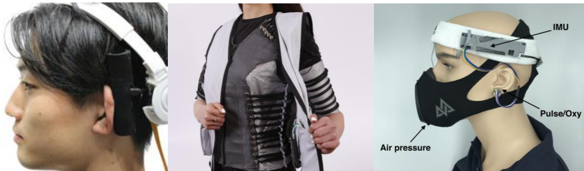
Haptics and Sensing: (left to right) ear manipulation to change sound direction perception [3], shape-memory actuators for dynamic compression [4], and cardio-respiratory sensor system [5].

Another emerging topic was the use of on-body mechanics to create novel stimuli. Shirota et al. developed a method of manipulating the outer part of the ear in order to change the perceived direction of sound [3]. Foo et al. used shape-memory actuators to squeeze the torso and arms in order to create the sensation of dynamic compression [4].