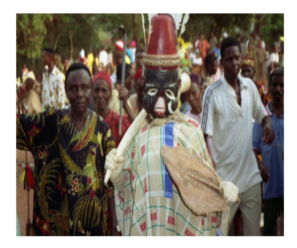
Fig 1 – Akuezuozo – Enemma Festival Nkpor, Anambra State, 1993

amazingly rise and shrink during a performance – such as the famous Wonder Masquerade or Orimili Obue Otaa (Ocean that Swells and Shrinks).