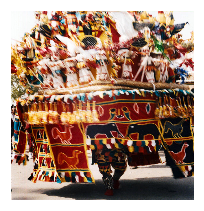
Ijele Masquerade

I have always been fascinated by the ljele masquerade ever since I saw one as a four year old on the back of my paternal grand-mother many years ago. I have seen so many other ljeles since, but I have developed a personal relationship with the ljele from my hometown, Nkpor in Idemili Local Government Area of Anambra State. I will therefore like to end the paper with a close look at the ljele , because for me more than any other masquerade type in Igboland, it provides the perfect example of the various roles, which the masking theatre fulfils for Igbo people and culture. For me, watching an ljele perform is like watching the Igbo World' or carrying the Igbo world on his head. The last ljele I watched was from Unubi although the performance was at the funeral of a highly respected elder in Nkpor and it was in March 1994. What mattered was the contemporaneity that was evident for that ljele too was old and yet modern by virtue of what it carried on its frame – ancient history cohabiting with modern technology and recent events.