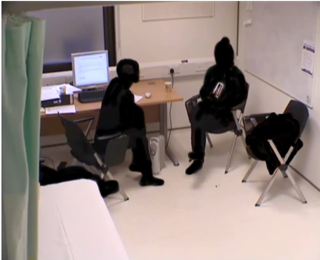
Figure 2 Anonymised screen grab of video footage from this consultation (filmed with consent) showing the non-verbal interaction.