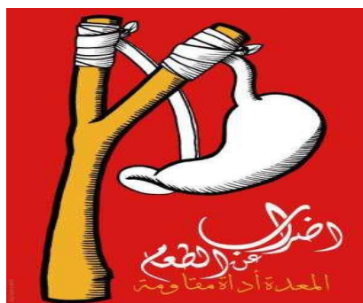
Fig 4 120