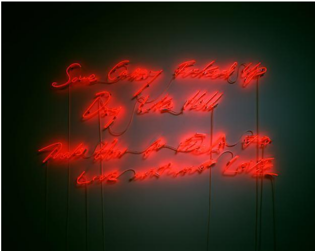
Fig. 12 Tracey Emin, Some Crazy Fucked Up Dog Like Hell That's How it Feels to Live without Love , 2009.

[fig. 12]. The neon text represents unrequited love as a dog-like infernal state, a state that Emin often alludes to in her work.