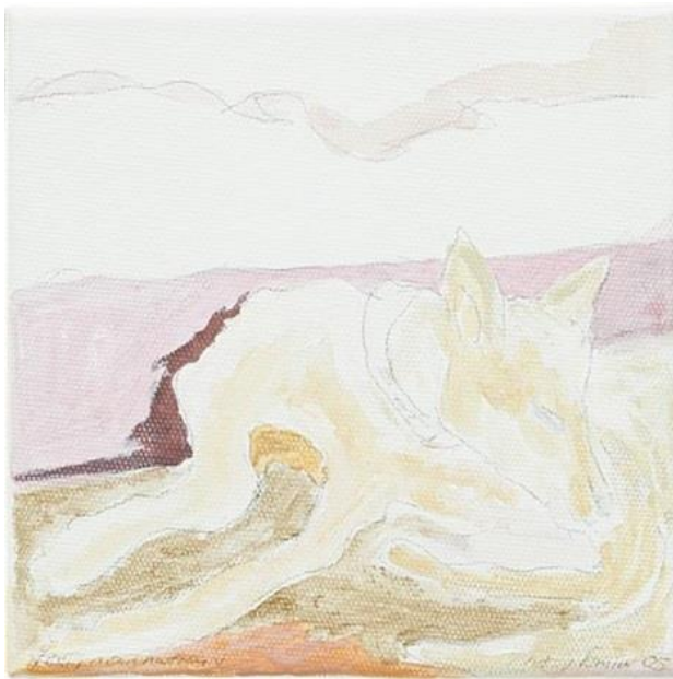
Fig.13 Tracey Emin, Reincarnation V , 2005.

Is there another word that can capture our experience of giving up something of ourselves in the face of an other's offering, or must it necessarily be that all love begins with fear? If all love begins with fear, does it end with indifference? Or, does it intensify and endure through the transfiguration of the lovers? Like artworks, stories will strike a different chord every time they are told. It is the nuanced details of the experience, as well as our lambish approach to the work, that can ignite alternative responses. Artworks can capture the living attention of the reader and, in their embrace, can transfigure both the perception of the work as well as the reader.