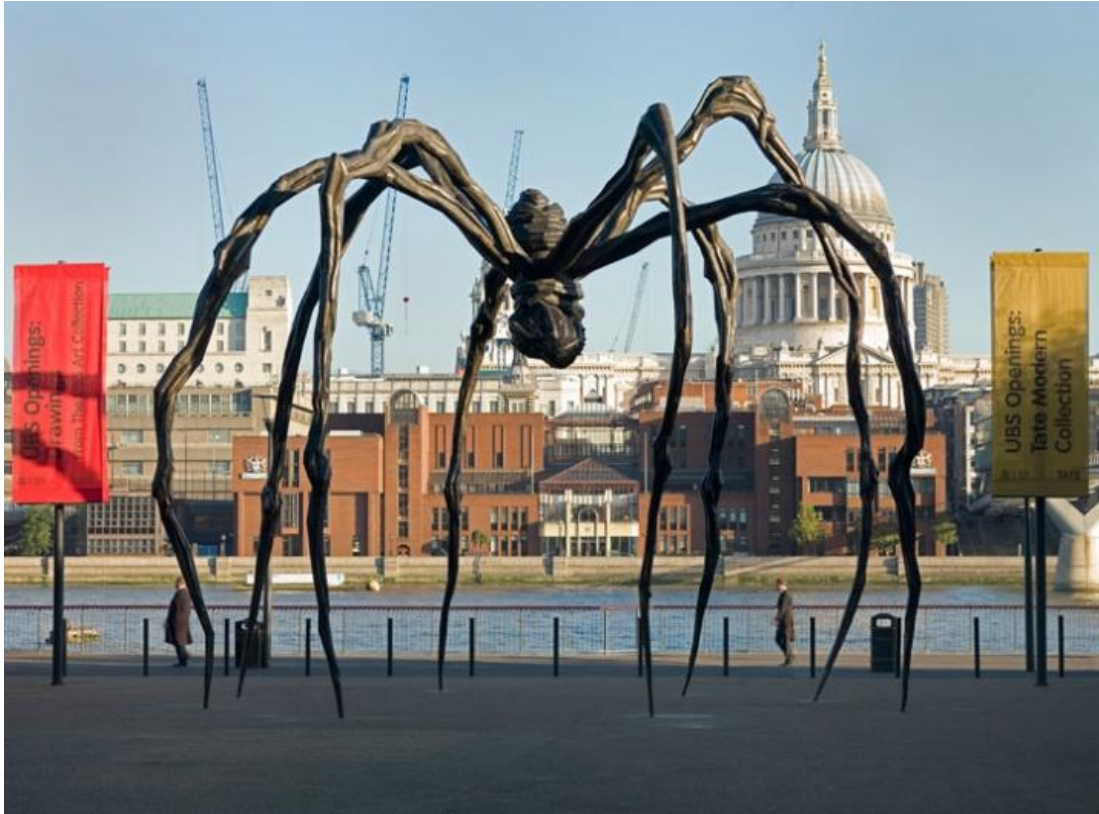
Fig. 6 Louise Bourgeois, Maman (1999). Sculpture installation on the north landscape of Tate Modern in 2007.

Secondly, the material may offer a way to contextualise the work as a response to a series of geopolitical and historical events that occurred during the artist's lifetime. The first routine is far more typical of scholarship in the field of traditional art theory and the second in the training of art history. Of course, there is ample overlap between these two forms of writing about art. However, in both instances, biography and autobiography are excavated as sources of "truth" about the artist's emotional or mental state reflected in the artwork they produce. In this manner, the artist's work is often considered as a representation of their "inner" state, or a response to an "outer" problem, event or situation.