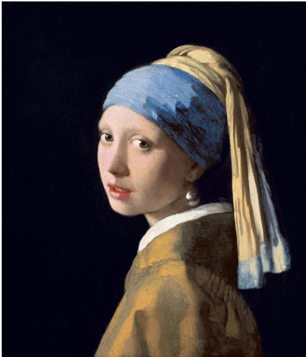
Fig. 2 Johannes Vermeer, Girl with a Pearl Earring (1665).