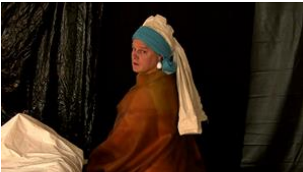
Fig. 3 Johannes Evers, Male Gaze (2011). Image still from performance from video.

At the tattoo parlour I spotted the table with copies of his new book. A collection of portrait photographs taken at the break of dawn were accompanied by the poetry of JL Nash. The images were vibrant, too vivid to be real, too saturated for dawn. There were prosthetic wings, extravagant props, butterflies, furs, tattooed figures posing as erotic, mythological creatures garnished in flowers. “Too fashionable,” I thought to myself. I was resentful in my queer solidarity for I didn’t feel that this oeuvre fulfilled the promise of our spiritual and psychoanalytic campaign. I had to accept that this is not what Predrag was doing in his book and I