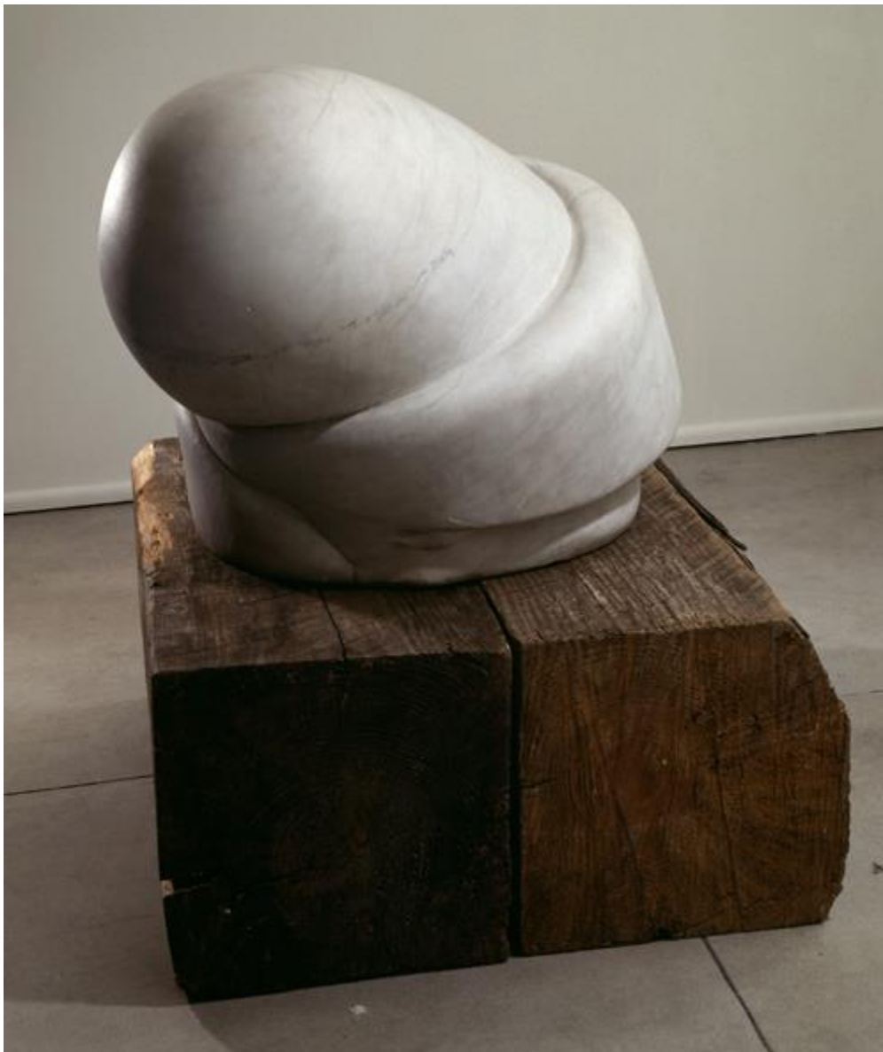
Fig. 7 Louise Bourgeois, Sleep II , 1967.

artworking as an effect of catharsis or cathexis at the expense of the work's technique, form and conceptualization. Secondly, it hinders the possibility of multiple interpretations that can stem from each individual's encounter with the work by indirectly framing art as independent from the context of its audience/reader. Thirdly, such autobiographical interpretations set up an ongoing (and usually unresolved) contest between the artist's truth and the critic's assumptions about the artist's truth. For these reasons, the plurality of possible interpretations are relegated to an unproductive, antagonistic and confined debate.