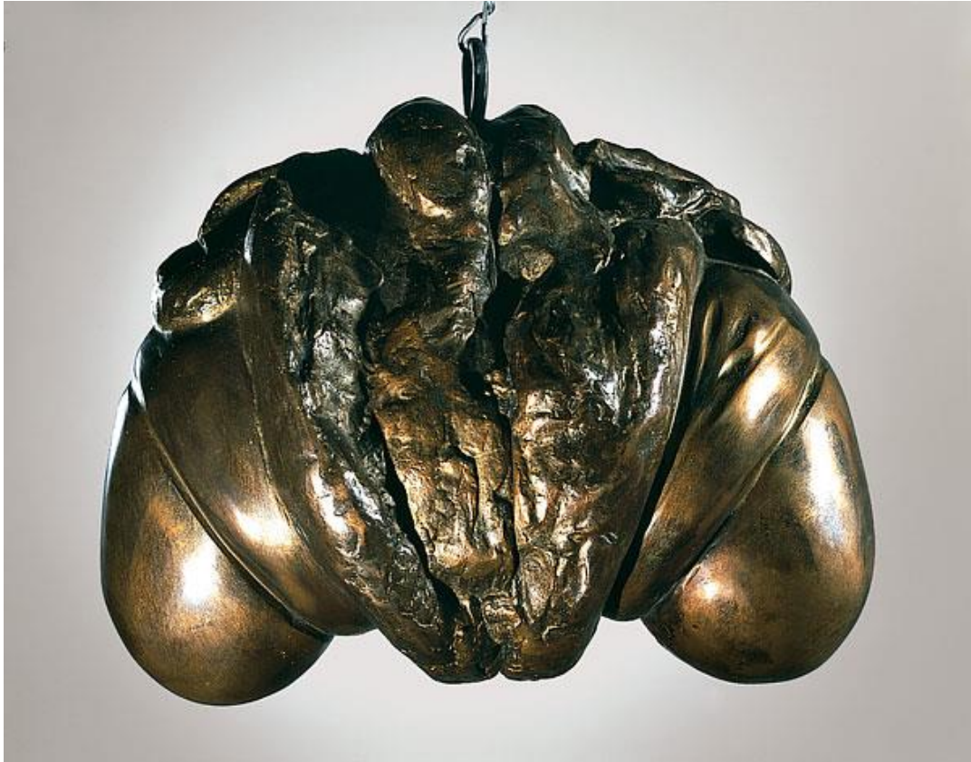
Fig. 5 Louise Bourgeois, Janus Fleuri , 1968.

As soon as the immortal works of the past became the object of social and individual refinement and the status accorded to it, they lost their most important and elemental quality, which is to grasp and move the reader or the spectator over the centuries.