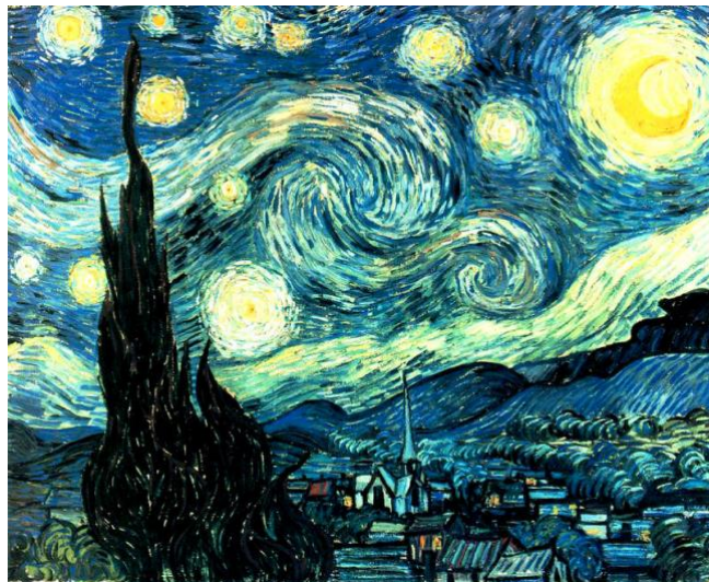
Fig. 8 Vincent Van Gogh, The Starry Night , 1889

That does not keep me from having a terrible need of—shall I say the word—religion. Then I go out at night to paint the stars. VINCENT VAN GOGH in a letter to his brother