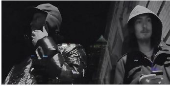
Figure 3: A collaborative performance, playing out in a City location