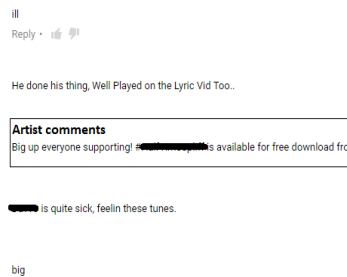
Figure 5: Stream of comments in YouTube

narrative of the songs, including acting out the narrative. One of the common features of these videos is the production of familiar imagery and language of the region as part of the media. As the genre emerged in London, music videos often feature references to iconic locations. The geographical context is deemed relevant and significant in this sense, with artists describing the feature of such imagery as, “authentic.” In the same way that products are stamped for quality, their digital stamp of authenticity are the visual features within the videos. Images of the area and famous landmarks often feature in videos and some music videos are even recorded in these areas in their entirety. This offers value twofold. The visual imagery provides a sense of identity, a recognizable visual cue which signifies authenticity. As a genre of music that is grounded in geographical legitimacy, many of the discussions in the comments of these pages pertain to legitimacy and talk about how “real” the music is. The comments on these videos point to the landmarks as recognizable identifiers, parks, statues and in some cases even postcodes of the areas in which the music video is recorded. Videos have also been grouped into playlists to offer a route through the genre. Semantic tags such as #grime and more recently #grimeUK offer a means by which to search for music videos of this type of content.