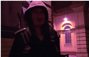
Figure 4: A music video featuring a popular location, uploaded to social media