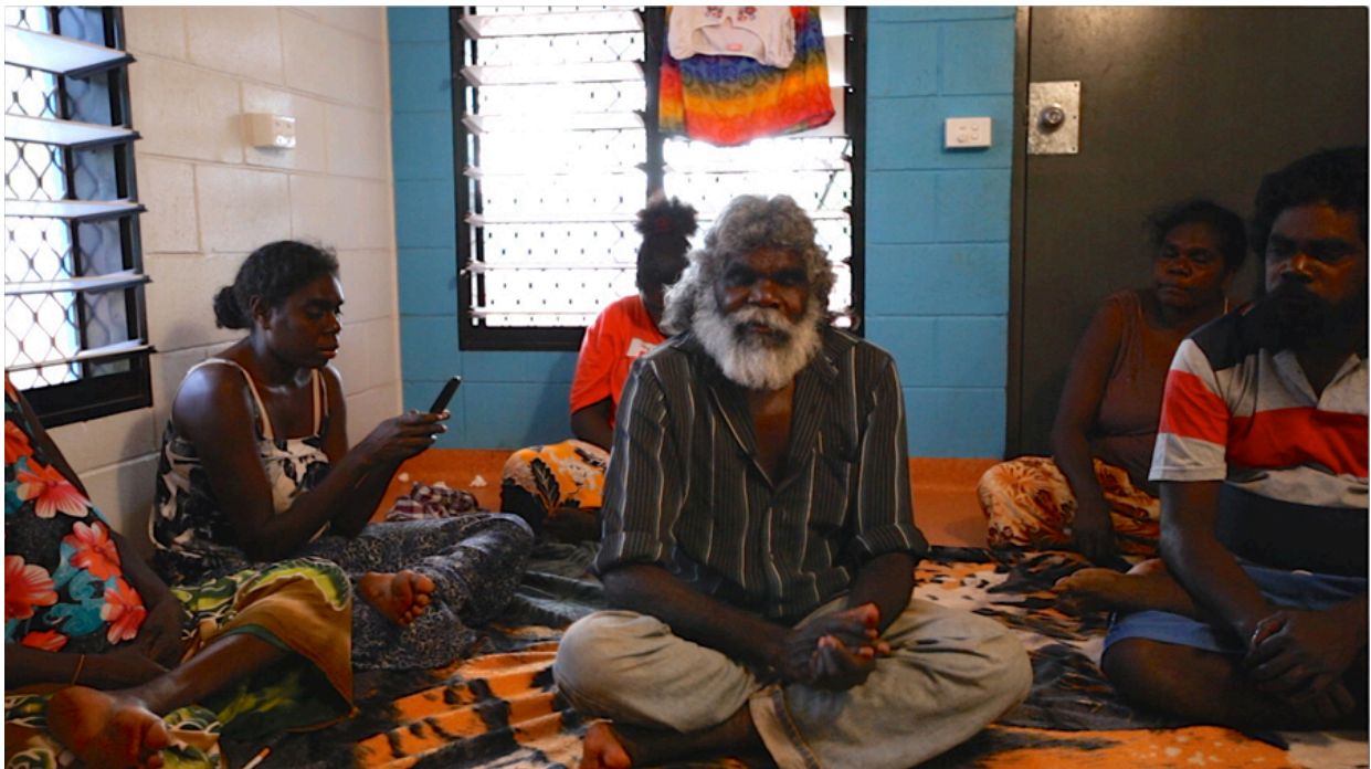
Fig. 3: still from Ringtone

One way or another, everybody's using their phone to connect. It's new. But then again, it's not. Even your ringtone can call you back to country, back to family, back to where you belong. Yolngu record clan songs from funerals with their phones and set them up as their ringtone. Whenever someone phones you hear that manikay (public clan song) and boom ... you're there. Just like sitting on the ground." (Gurrumuruwuy, 2016, p. 86)