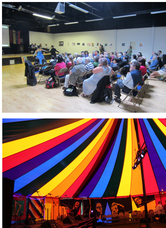
Figure 4. The main places of the festival: Y Plas and The Marquee

of Latin American and Welsh culture. The other two rooms are smaller. During the festival period, the organisers rename the rooms 'V́ctor Jara Room' and 'Violeta Parra Room'. Outside the main building, there is a big green area with a marquee. Inside this marquee is a stage and chairs, and behind the marquee's main stage, there are four paintings affixed to the wall – portraits, painted by Polly Henderson and Keith Jackson, of V́ctor Jara, Violeta Parra, Ali Primera and Salvador Allende. Near to the marquee, there is also a woodland or outdoor green area with stalls which is used as social space for festival-goers, and for ad hoc performances.