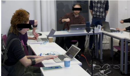
Figure 3: Workshop participants using regression and temporal modelling.

others enabling exploration – and critiqued the fluidity of response of the models. They discussed the choice of algorithms as a trade-off between faithfully reproducing the stimulus and creating a space for exploration to produce new, unexpected ways to articulate sounds.