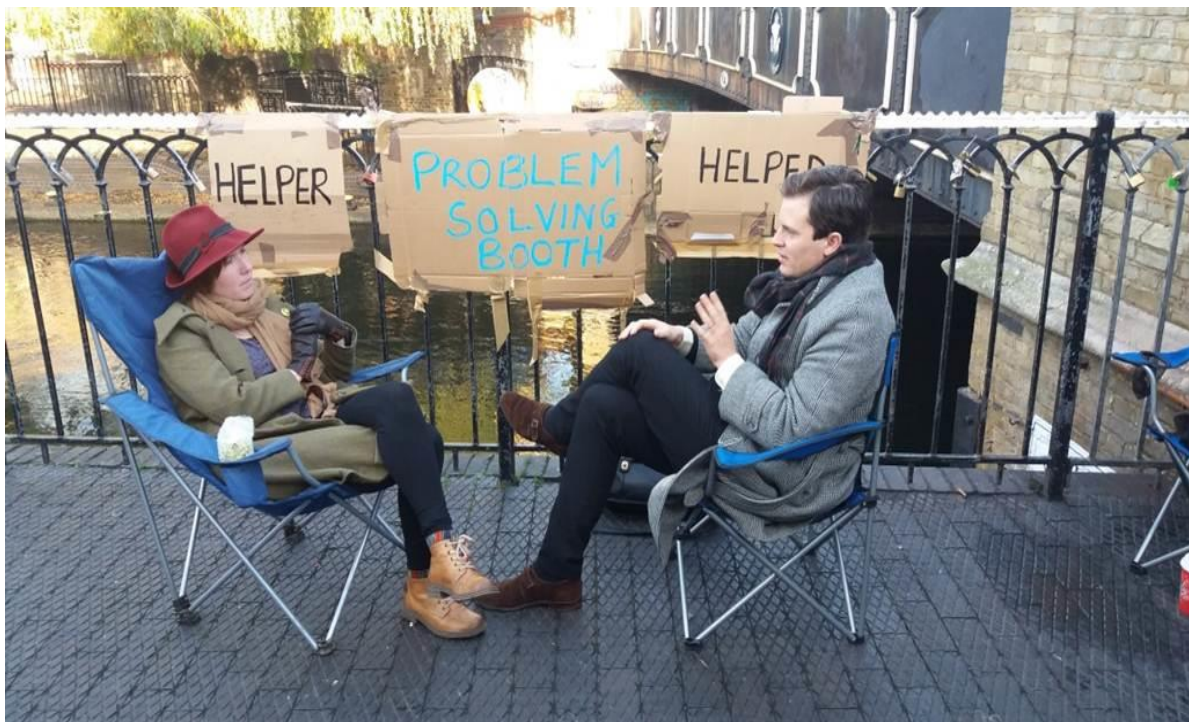
Fig 2: Original Problem-Solving Booth concept

The original concept by Owls was kept deliberately simple, comprising only of two chairs and handwritten signage drawn on cardboard boxes in black marker pen (see Fig 2 below). The home-made appearance of the original PSBs was integral to their appeal, making them seem approachable and not too professional in appearance.