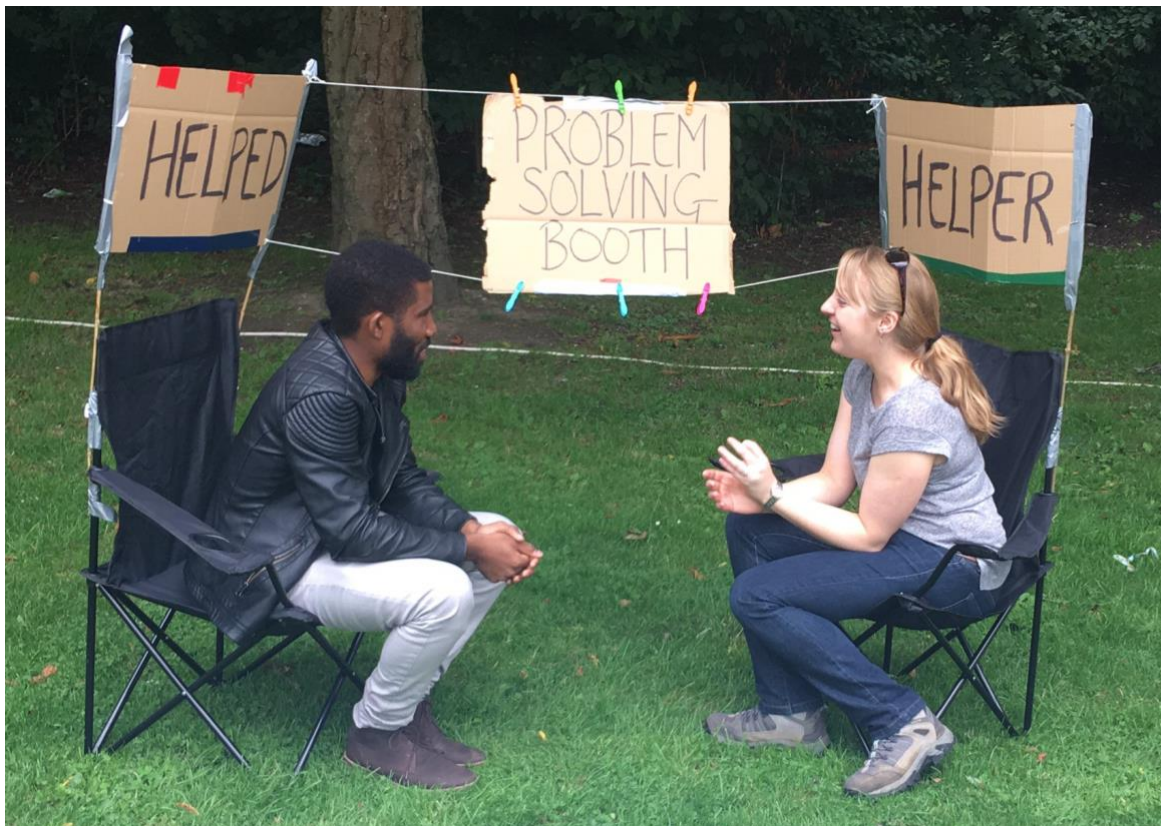
Fig 5: Improvised PSB design

Volunteers were also encouraged to improvise their own PSB designs based on the contents of the PSB kits; for example, the PSB illustrated in Fig 5 features the bamboo canes attached directly to the legs of the camping chairs, with the signage suspended on string.