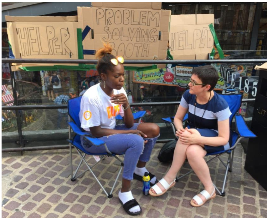
Fig 1: Problem-Solving Booth in Camden Market

The booths consist simply of two chairs and some signage, encouraging members of the public to sit and take the role of either the 'helper' or 'helped' and have a conversation about their mental wellbeing and anything that they would like advice on. A typical PSB is run by three or four volunteers for 90 mins.