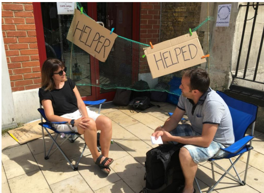
Fig 4: Free-standing PSB in Brixton