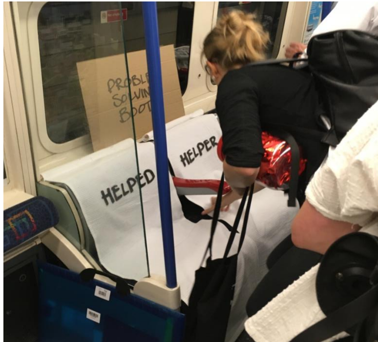
Fig 6: Seat covers devised for PSBs on the tube

In response to the space constraints preventing the set-up of camping chairs on a tube carriage, staff and students at Goldsmiths devised and fabricated a pair of ‘helper’ and ‘helped’ seat covers, behind which a cardboard sign could be propped (Fig 6).