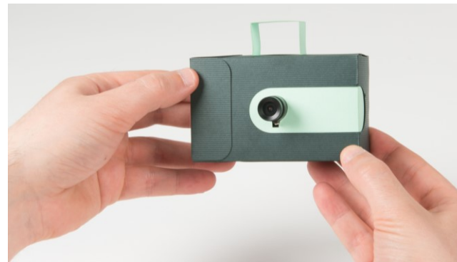
Figure 1: Paper-clad TaskCam.

The resulting camera can be packaged for immediate use. Alternatively, the PCB, which is perforated and predrilled, can be snapped apart and reconfigured in a variety of ways. About a dozen configurations (including one for a screenless camera about the size of a box of matches) are possible without soldering simply by plugging the separated boards together in different combinations, and other possibilities can be realised with a limited amount of soldering. This allows TaskCams to be constructed in a variety of forms chosen for their affordances or aesthetic qualities.