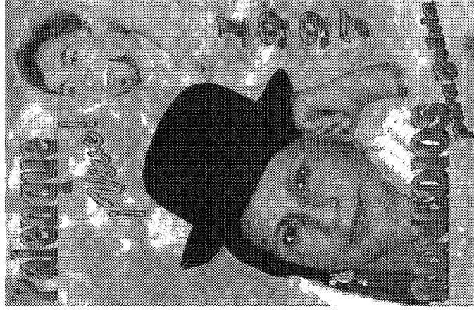
Campaign poster, 1997

According to Andres Soliz Rada, "Condepa has always revolved around its key symbols" (PR: 11.03.97). Carlos Palenque was and remains their primary symbol. When he was with Mónica, as a couple they were very important to Condepa propaganda (Miura, 1996); now, the living symbols are Remedios Loza and Verónica Palenque. A study of their power expands two themes which have already been touched on – the symbolic importance of women in Condepa discourse and the rhetoric of the Condepa "family".