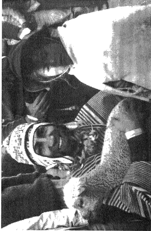
Carlos Palenque during the election campaign 1989