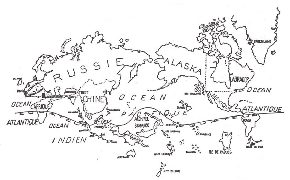
Figure 2. Artist unknown, 1929. Surrealist Map of the World. From 'Le Surréalisme en 1929', special issue of Variétés (1929: 26–7).