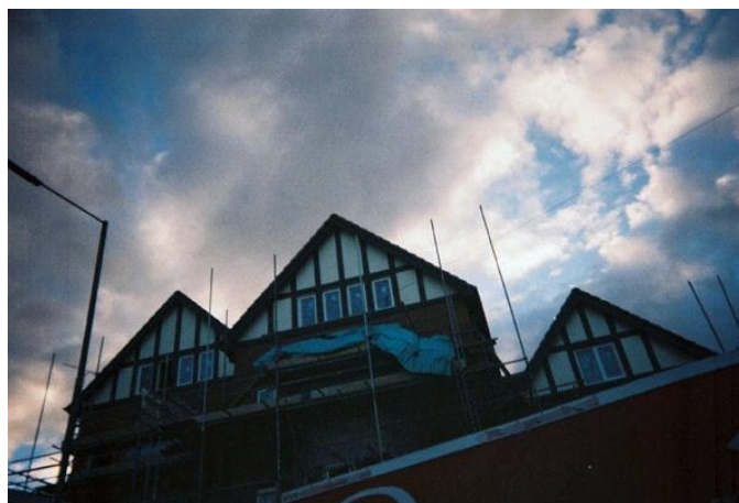
Figure 7: Renovation on a ‘character’ house

The visual study cued participants to look at their neighbourhoods with an aesthetic sensibility. Buildings and features of the town that were ‘pretty’, ‘jolly’ or ‘sympathetic’ were photographed by some participants. (However, buildings and streets were more often represented in the negative, with reference to unattractive or poorly maintained properties, as discussed below.) While photographs in this general (researcher-generated) theme were common among participants, the images were disparate in subject matter. 13 One woman took a photograph of a terrace of houses, which included her own, in silhouette against pink-tinged evening clouds, because she and her neighbours kept their homes well-maintained. Another woman took a photo of a distinctive house with lots of statues, fountains and columns in the front garden, owned by a modest immigrant family, because ‘ it makes me smile ’. One man was interested in the ‘character’ houses in the town (in contrast to anodyne new buildings in bland or unsympathetic styles):