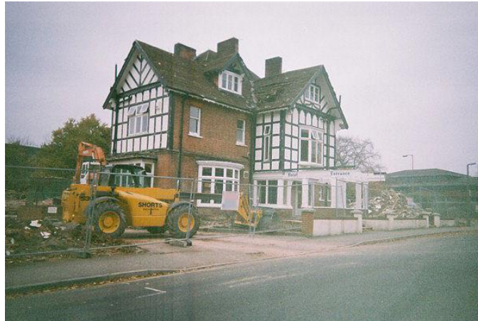
Figure 15: Old building, soon to be demolished