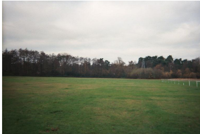
Figure 5: Open area in Hilltown's recreation ground

The recreation ground was seen as both an amenity and an open space. A Woodside woman said of a similar photo: