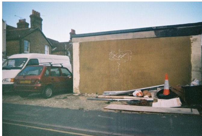
Figure 18: Graffiti and rubbish as an 'eyesore'

It's pretty horrible isn't it? [Figure 18]. It looks like a scrap heap. ... A pile of rubbish, basically. ... And you've got a bit of, someone's tag there. At some point there was a fire here, and the building is an eyesore, is the word.