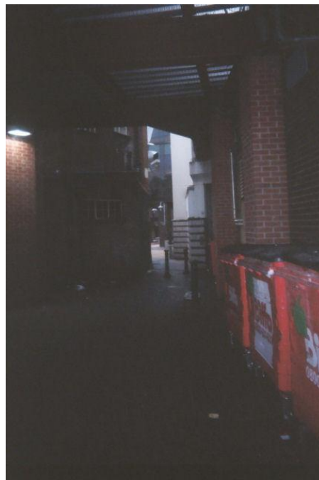
Figure 20: Alleyway with skips

Fear of crime was triggered for participants by places that were unlit and isolated, and participants often said they avoided these places, especially at night.