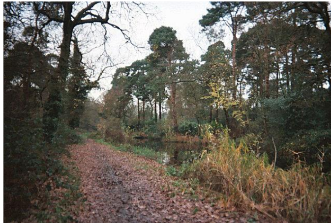
Figure 22: Beware of paths

The canal towpath, while appealing for walks (despite the occasional rat) also could be a place to avoid at night: