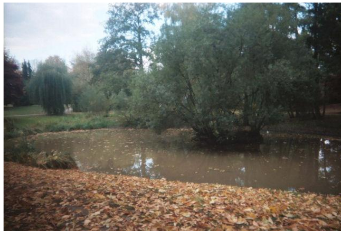
Figure 2: 'A very big pond'

Participants frequently recorded images of usable 'nature' – green spaces and open places. None of the areas was truly natural; all were human-made elements of the town's parks, roadways or canals. Nevertheless, participants enjoyed these areas and told us stories of how they used these places. Often, therefore, the places were associated with personal memories of the good times had there.