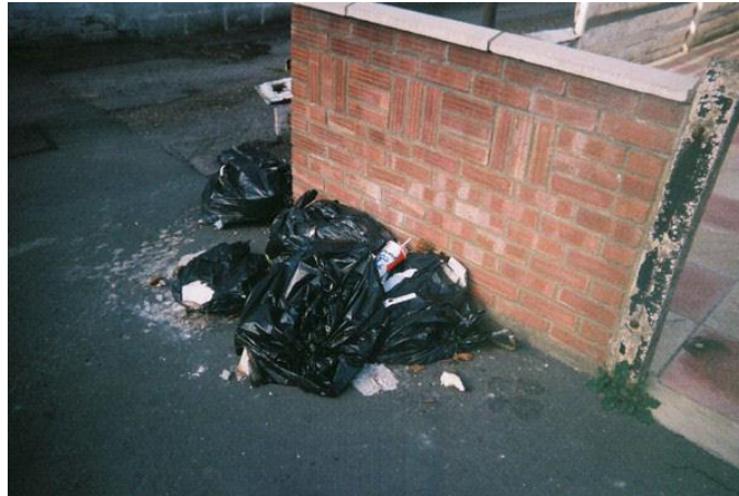
Figure 11: Rubbish, 37-year-old, white-British woman, 18B(RS-HH)