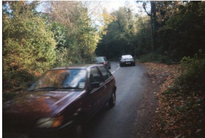
Figure 23: Cars speeding around the bend

A final area of concern to the participants was the speed of cars and lorries, which suggested the possibility of traffic accidents and of children being run over.