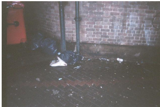
Figure 10: Bin bags and litter

One girl discussed Hilltown’s efforts to clean up litter: