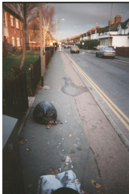
Figure 12: Rubbish, 30-year-old, white-British man, 28B(RS-HH)

A woman, interviewed with her husband, took a picture of a bin in the playground: