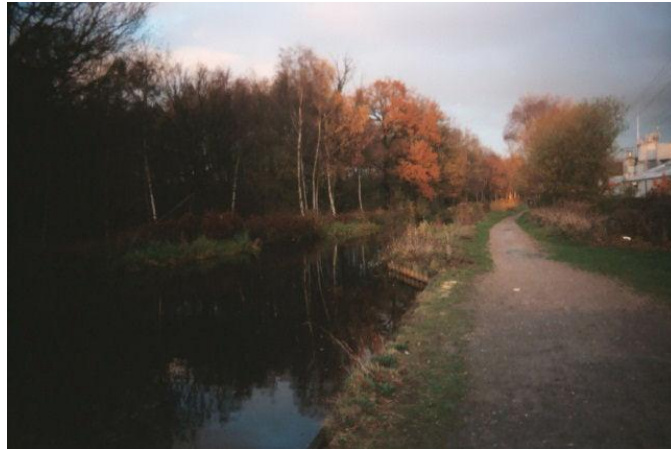
Figure 4: The canal

Wife: And that is a nice picture of the canal [Figure 4].