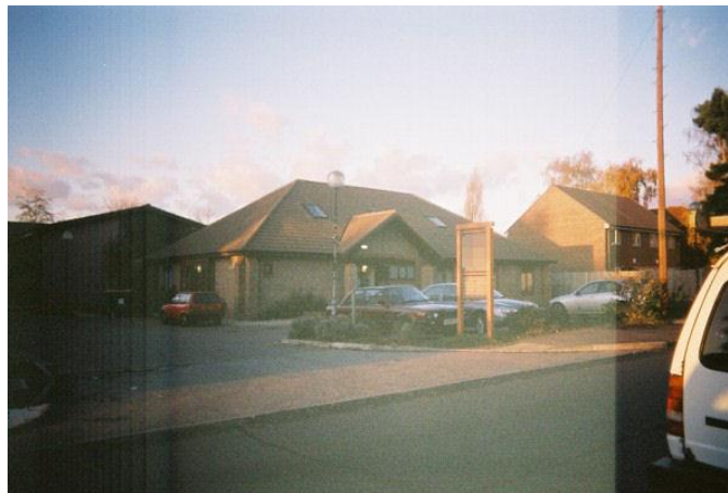
Figure 1: ‘The doctor’s surgery’

Unlike the verbal questions in the first round of interviews, the visual project cued participants to think about what their neighbourhoods looked like , that is, taking photos cued an aesthetic perspective. For instance: