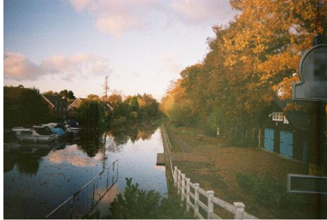
Figure 3: Canal towpath with wheelchair ramp (not actually visible in the photo)

The canal was frequently mentioned by participants. Hilltown residents often walked on the towpath, and the trees and vistas of the canal were seen as attractive elements of the town.