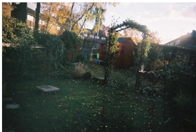
Figure 8: 'A little patch of earth'

Several participants took photos of their own house or garden to indicate positive features of their neighbourhood. Participants who photographed their homes and gardens discussed feelings of safety and security. Three participants specifically discussed their back gardens and the birds that are attracted to feeders, which gave them pleasure and satisfaction.