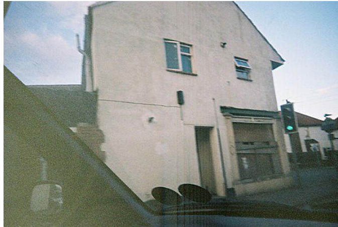
Figure 14: Boarded-up building

One of the worst-looking places near where I live, [Figure 14] well, it's glaringly obvious that it is horrible. It's boarded up.