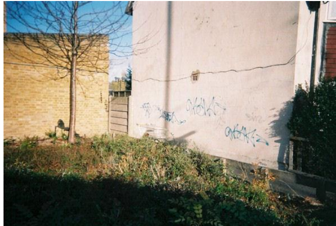
Figure 17: Graffiti in an alleyway

Graffiti. [Figure 17] That's like an alleyway the children normally go down. I never have; I don't need to.