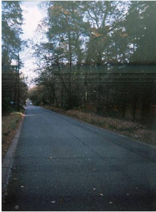
Figure 6: Tree-lined road (through the car window)

We really appreciate the wide road reserves that they have in [County]. That's a fairly typical sort of aspect that you might see [Figure 6]. That happens to be [Name] Lane on the way to the dump, but nonetheless that is exactly the whole point of it. It conceals behind that bank of trees and apparent greenery, anything from a council estate to the local dump to the local golf course, to you name it which we find really tremendously beneficial.