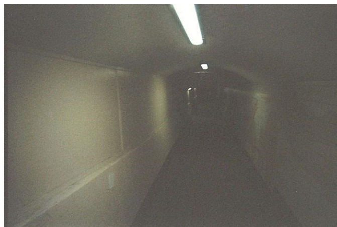
Figure 21: Subway under the rail line

The fourteen-year-old girl took a related picture of the pedestrian subway under the railway line.