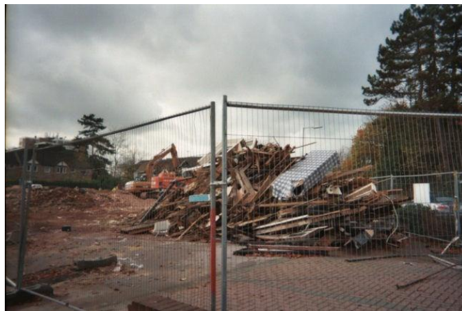
Figure 16: All that is left after the demolition

It's always been some sort of a bar or some sort of an inn [Figure 15]. And it's, it was one of those old-style Hilltown buildings. The way Hilltown used to look, you know, before the seventies came along [laughs]. And they've knocked it down and if you go past it now it's completely empty and all the plot is empty, nothing there. This [Figure 16]. Just a mattress there. ... And in its place are going to be god knows how many flats again and that's, that's the thing about Hilltown, they are just building flats at the moment everywhere and they are tearing down nice houses with, you know, a bit of ground round them and all that and just cramming it all full of yet more flats.