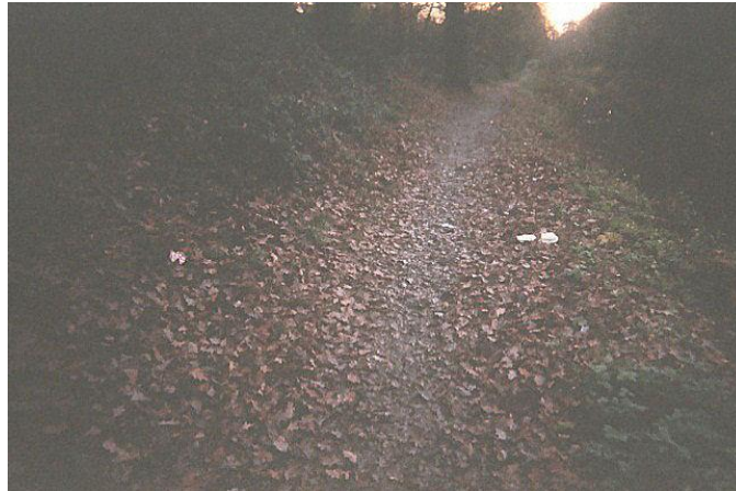
Figure 13: The canal path with rubbish (and rat, just outside the frame)

Coming back to this theme later in the interview, the couple discussed a photo of litter on the canal path: