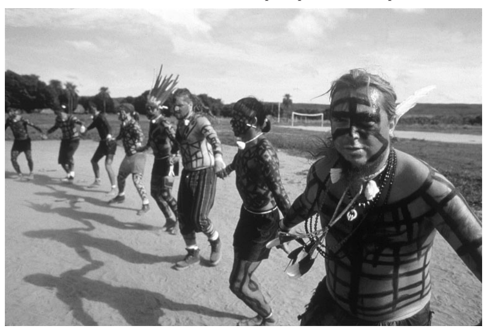
Figure 5. Sepultura recording with Xavanta tribe, Pimentel Barbosa, Brazil, 1996

Like all such projects, Roots has its problems. Whilst the Xavante appear to have been treated with respect and receive royalties, it is unclear how they understood the project and what they will get out of it. The Xavante had little say on how the piece was set within the album (although 'Itsari' was not overdubbed at all). Neither can Sepultura ensure that those who purchase their albums will not exoticise the Brazilianness in the project. Nonetheless, Sepultura did approach Roots in a spirit of discovery that avoids many of the pitfalls that other artists have fallen into in such projects. The collaboration was not intended simply to add exotic 'colour' to their music, but was a sincere (if perhaps naïve) attempt to collaborate