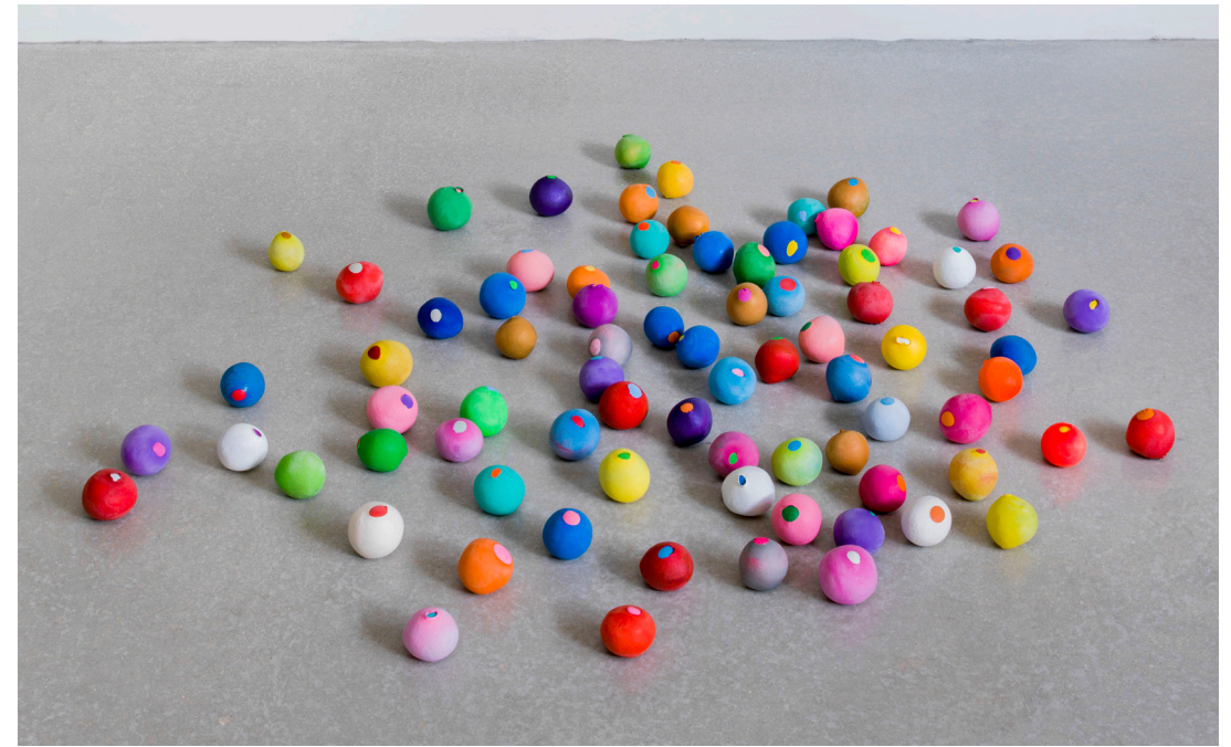
Claire Fontaine, Untitled (Corps étranger) , 2017. Latex balloons, plastic bags, hempseed, yellow and red millet, linen seeds, canary seeds, and whole oats. Eighty-one individual elements, dimensions variable.

Water as a medium of storytelling and archive finds further resonance in Deborah Ligorio's Care: A Somatheory Encounter (2017). The work comprises a video and an installation in which