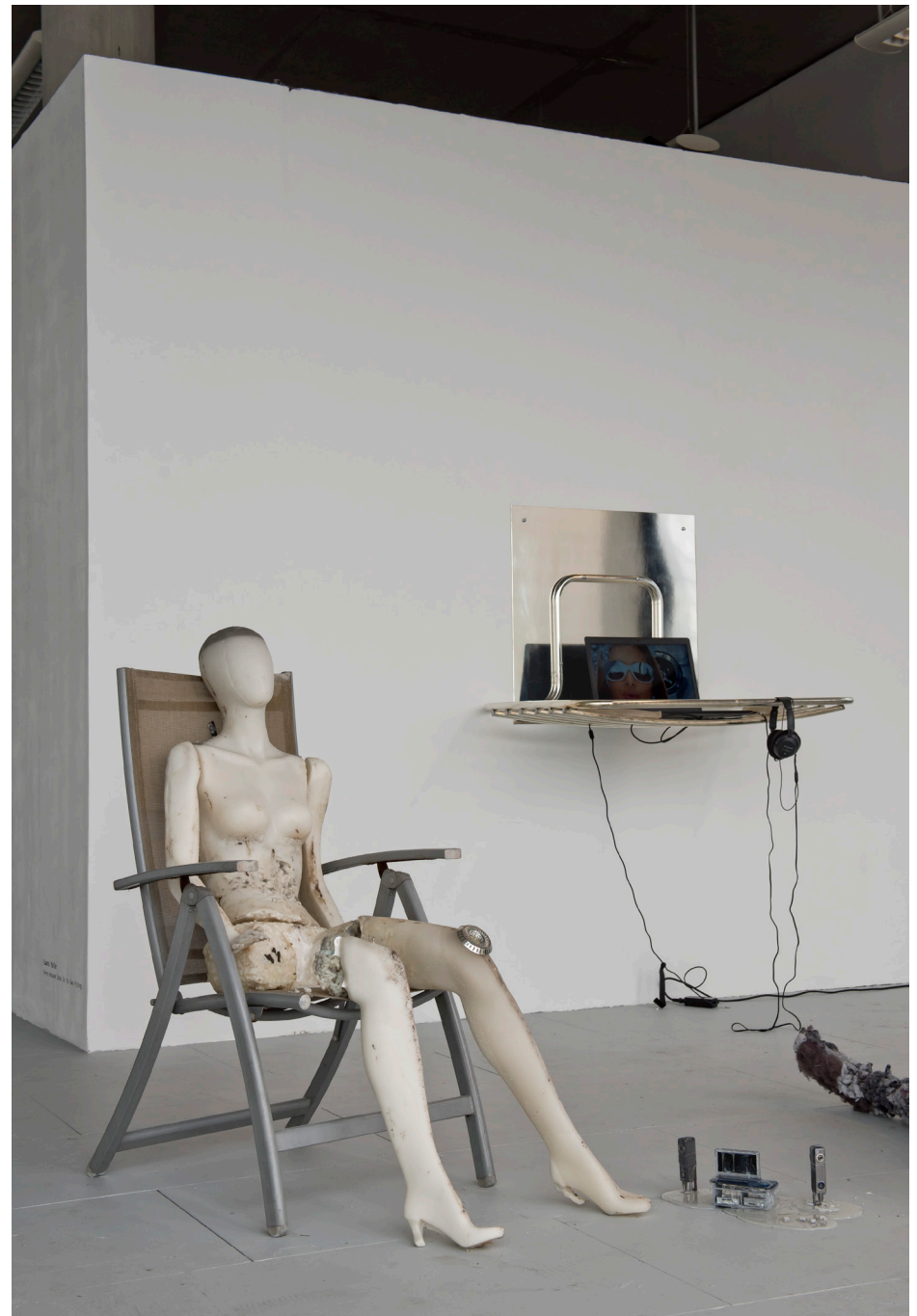
Laura Yuile, Mother Figure #1 and Public Feature (installation view), 2017. Steel, chrome paint, laptop, digital video, soap, eucalyptus oil, dirt hand-picked from “The Street,” Stratford, Westfield, London, small hi-fi system, small “home” decorative wooden word blocks, glass wax.