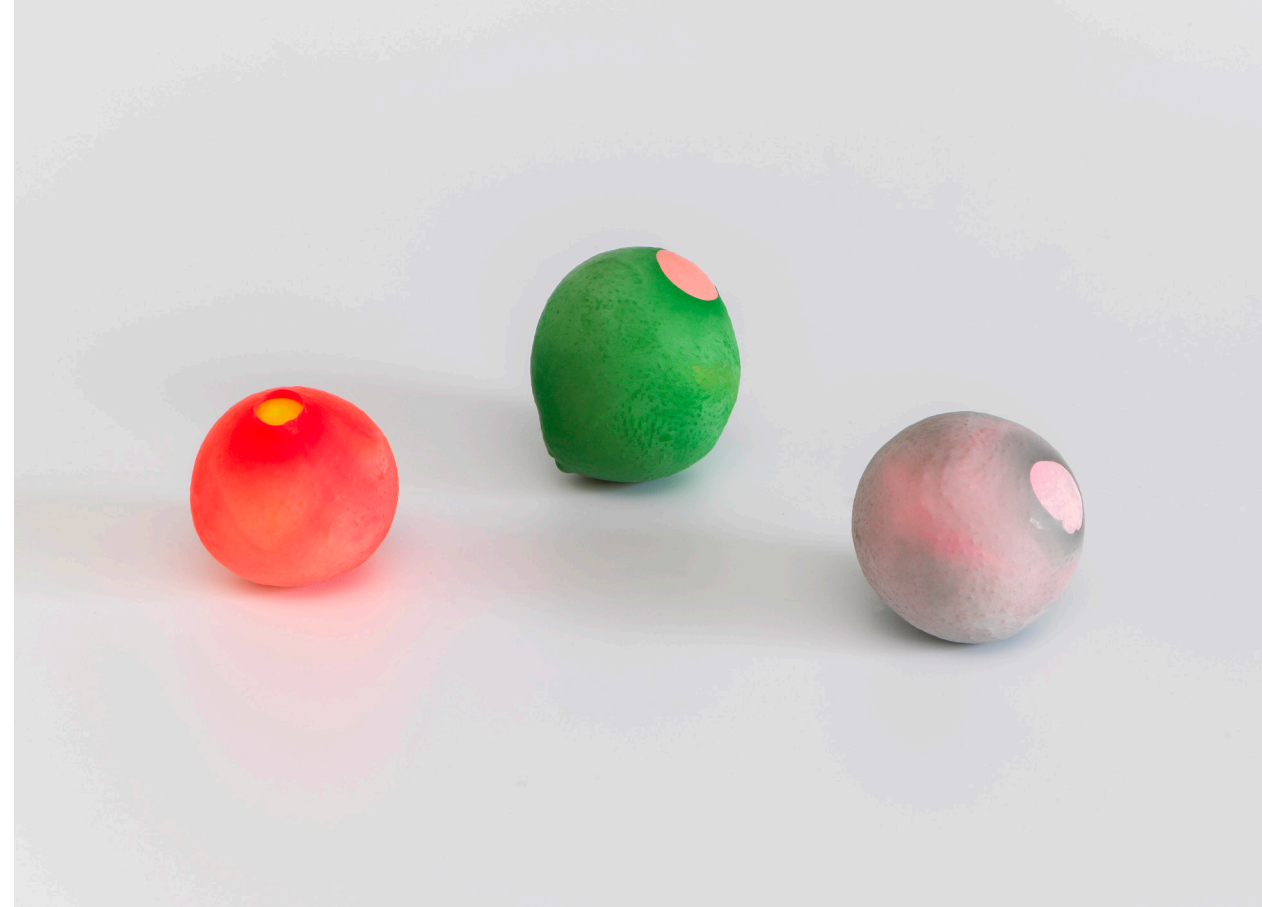
Claire Fontaine, Untitled (Corps étrangers) (detail), 2017. Latex balloons, plastic bags, hempseed, yellow and red millet, linen seeds, canary seeds, and whole oats. Eighty-one individual elements, dimensions variable.

Workshop presented in preparation for The Let Down Reflex , curated by Amber Berson and Juliana Driever for Take Care, Circuit 2: Care Work, October 16–November 4, 2017 at the Blackwood Gallery.