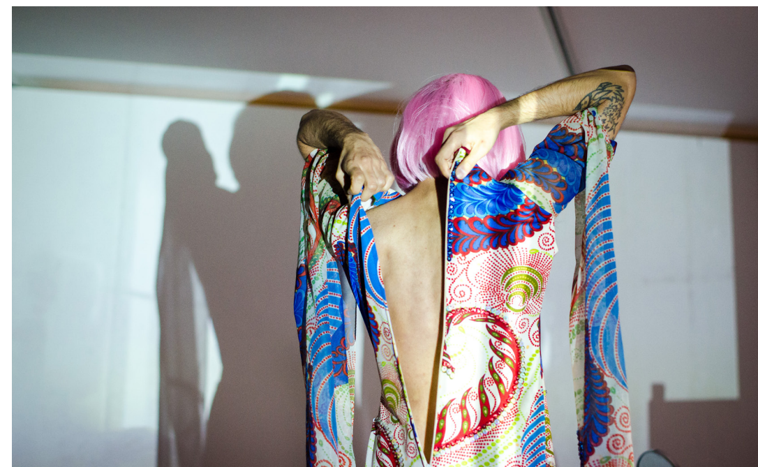
Raju Rage, Visibility or Opacity (performance still), 2016.

tumour from the body. By contrast, the small, brightly coloured balls scattered on the floor in Untitled (Corps étrangers) (2017) present a scene of horizontal gathering and assemblage. Filled with seeds, the balls are modeled on those used in the anti-gymnastics techniques devised by Thérèse Bertherat. When placed under parts of the body they initially cause discomfort and contraction. Only later do they create a form of physical release that Claire Fontaine equates with the positive impact that foreigners can have on society: “Initially rejected, they can bring the community to a new state, more harmonious and balanced than the previous one.” The ambiguous presence of the cover of Shulamith Firestone’s 1970 book The Dialectics of Sex: The Case for Feminist Revolution in the brickbat missile of 2014, points to the explosive power of this radical, proto-cyber-feminist’s ideas about surrogate childbirth and non-conformist parenting. In the context of Habits of Care , Firestone’s book evokes the difficulties that women continue to face in negotiating their own care and flourishing in relation to the many other care-