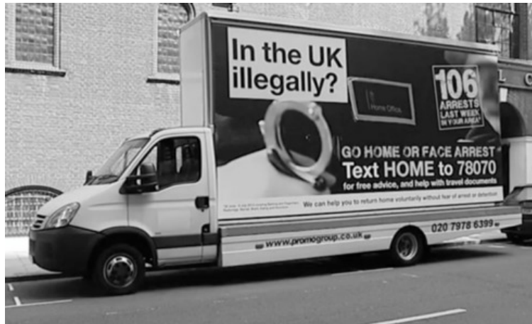
Figure 1: Go Home van

she's alone here, she doesn't know anything. She does not know about the rules. In this new world her husband is everything. Imagine that her husband beats her and kicks her out. She tries to ask her family for help but they will not let her come back: 'Where will she live? Where will she go?'