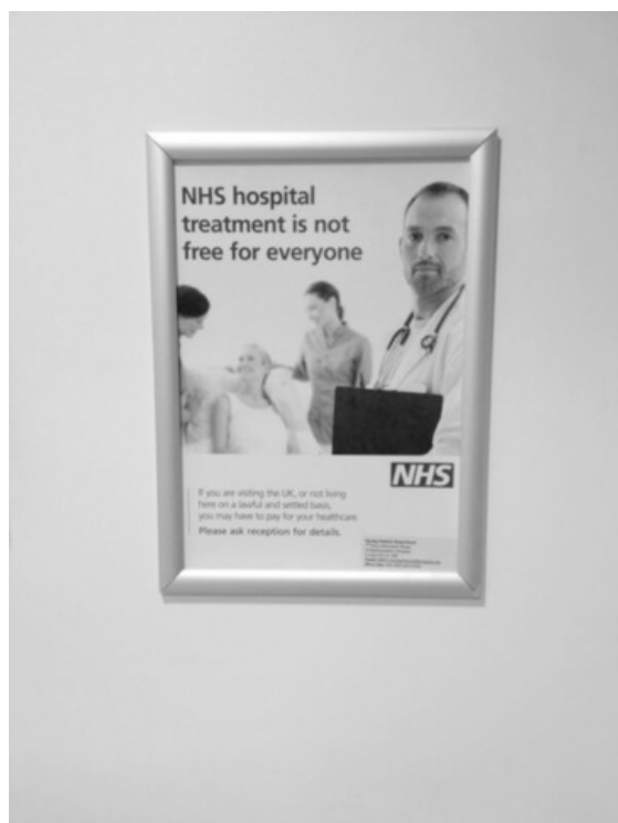
Figure 2: Signs in NHS on limited rights to healthcare for some migrants

Alongside focus groups, interviews and observations in our own six research locations, to help us understand how the wider population reacted to these campaigns, we commissioned a survey from Ipsos MORI on attitudes to Home Office immigration campaigns (see the Appendix for more details). The opening section of the survey mapped public awareness of a number of overlapping initiatives, chosen to represent the focus on communicating the active pursuit of immigration control. The survey asked people whether they were aware of the following: