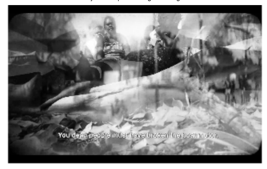
Film stills from Wutharr: Saltwater Dreams by the Karrabing Film Collective, 2016.