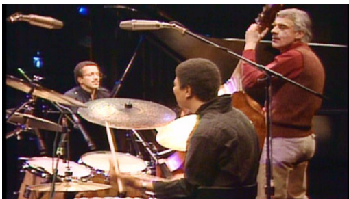
Figure 5: The Standards Trio: Keith Jarrett, Gary Peacock and Jack DeJohnette. Arguably the most accomplished jazz improvisation outfit ever because of a deep connection with the emotionality of the unfolding music and an almost telepathic awareness of each other.