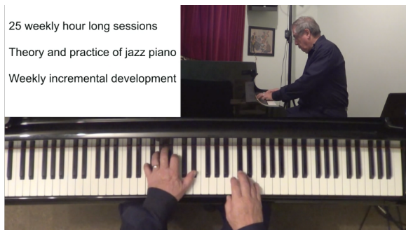
Figure 4: Learn Jazz Piano Online by Ray d’Inverno. Jazz courses like this give a sense of the enormous scope of technical knowledge needed before improvisation can happen.

the issue of designing systems that are truly responsive to human improvisation.