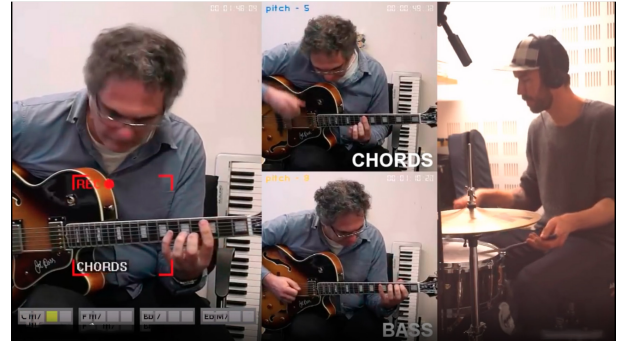
Figure 2: The reflexive looper from Sony CSL. This system provides a clear sense of musical agency for the performer.

ing to use the most musically appropriate segments of what had been played previously. As the performance develops, the representation of you as a performer develops, allowing the system to make increasingly varied and nuanced decisions about what to play while performing. This dialogue challenges and stimulates the live performer to push themselves further, creating yet more ideas that are then added to the growing data base for instantiating musical copies.