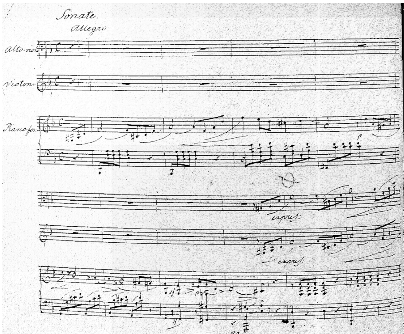
Illus. 4(b). The opening from the third manuscript.

likely that the last pages were simply lost as possibly were the last pages of the first manuscript.