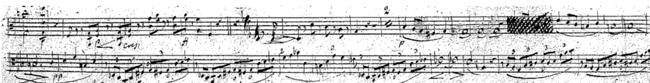
Illus. 7: Development, second manuscript, page 1, lines 10–11.

moderato , but the third has only Allegro . Borisovsky kept the tempo indication of the third manuscript. The elegance and eloquence of the main subject of the first movement in D minor, which at first starts in the piano part, was a work in progress for the composer, as his initial version differs from his final choice. (See Illustration 4.)