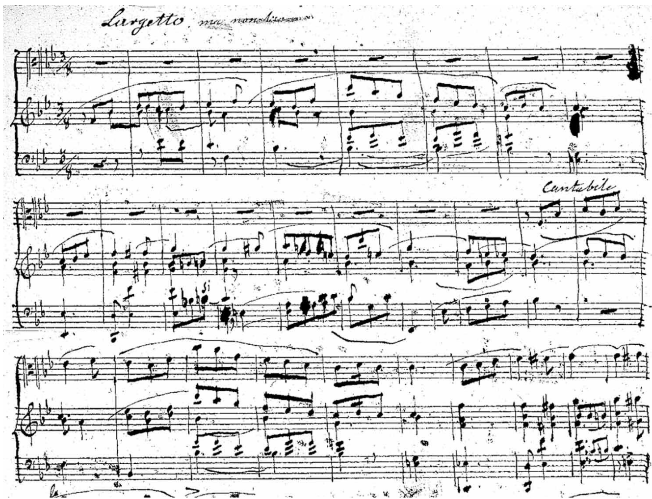
Illus. 9(b): opening measures, third manuscript/first manuscript.

This arrangement has proved to be reasonably effective, as it gives a better development to the melodic line in the viola part and therefore avoids unnecessary repetitiveness. (See Illustration 10.)