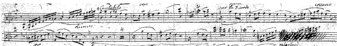
Illus. 5. Second subject, second manuscript.