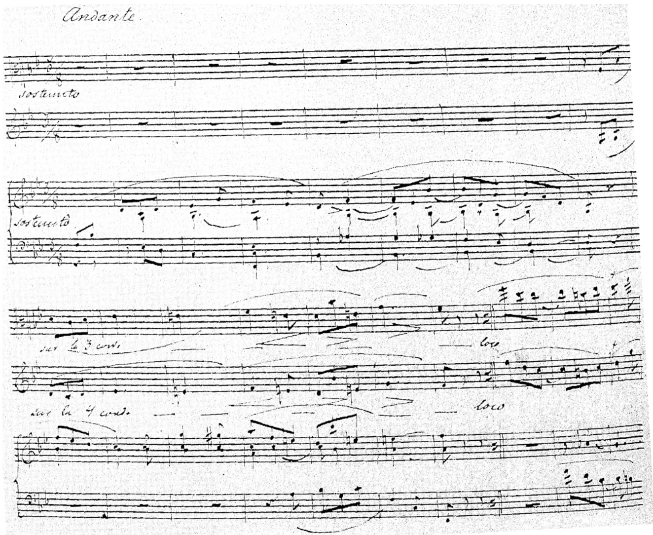
Illus. 9(a): opening measures, third manuscript/first manuscript.

The recapitulation also had only minor alterations in the second and third manuscripts. (See Illustration 8.)