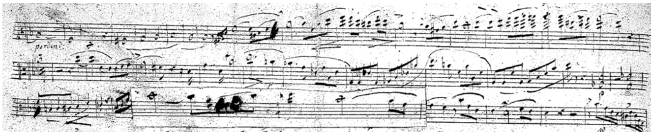
Illus. 8: Recapitulation, second manuscript, page 2, lines 1–3.