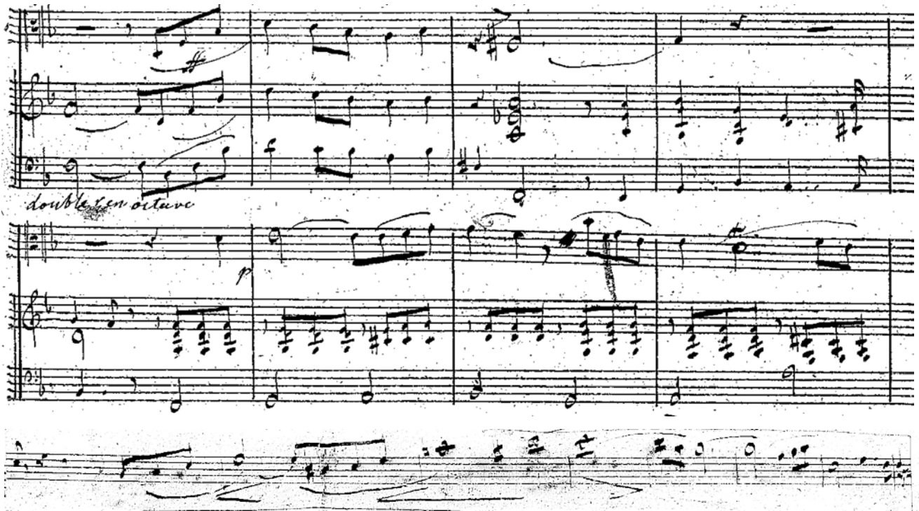
Illus. 3: First manuscript, mm. 33–40 and its new version in the second manuscript (third line).