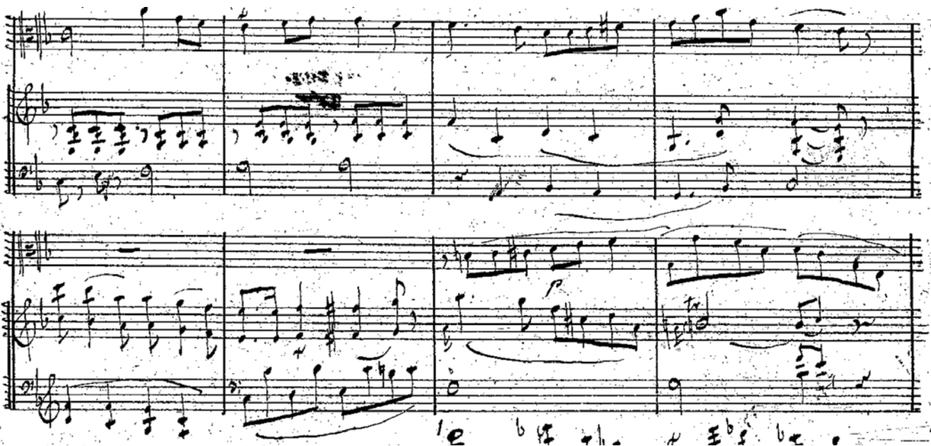
Illus. 6. Second subject, first manuscript, pages 3–4.