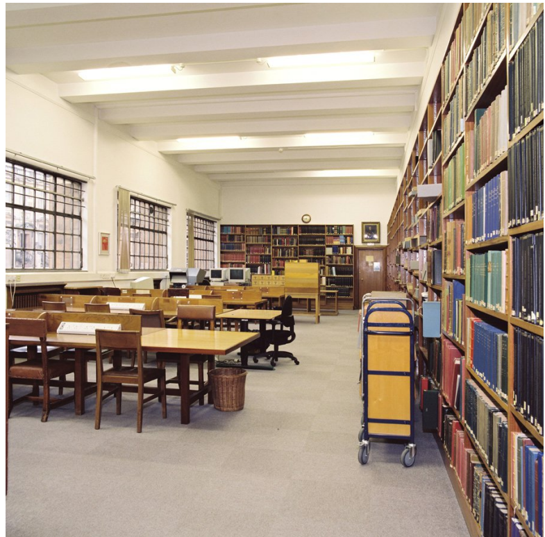
The old Special Collections Reading Room.