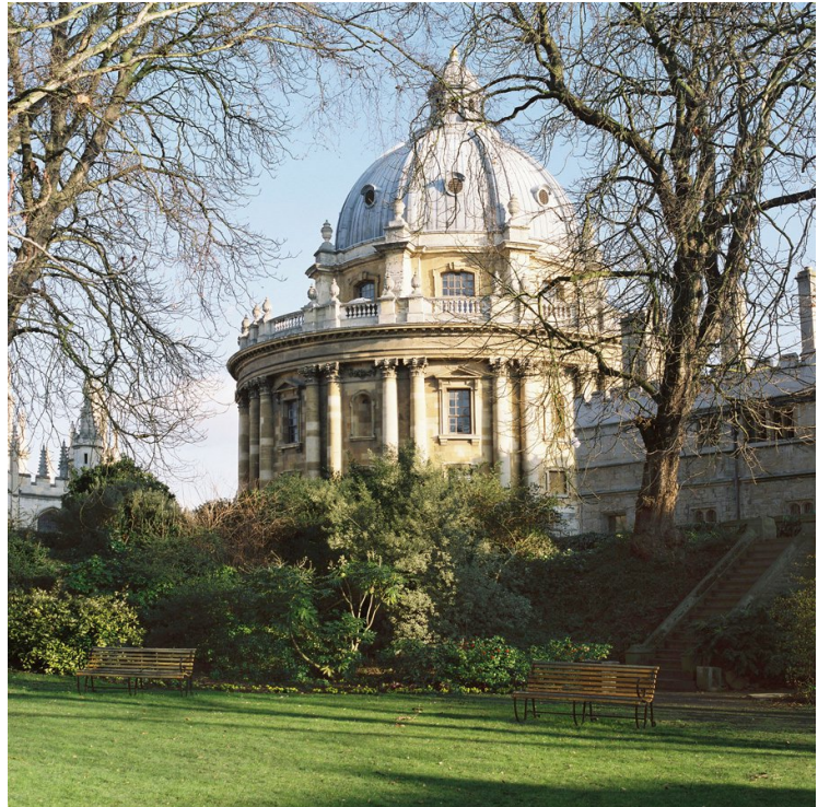
Radcliffe Camera.