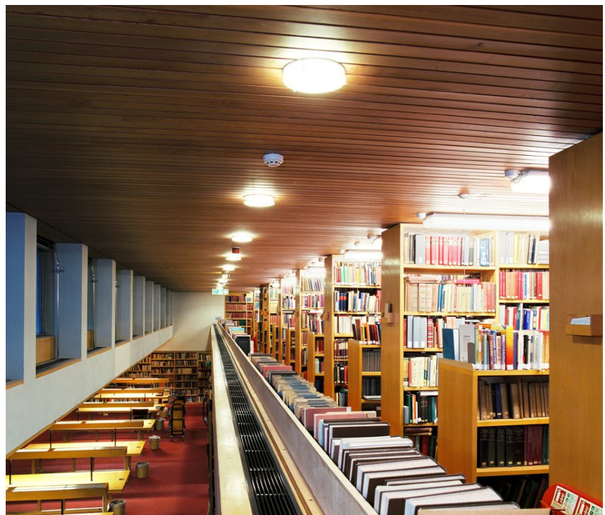
Interior of Indian Institute.

interference by Russia, Britain, and the USA? In all this long experience, it is perhaps the 1953 coup against Mohammad Mossadegh, following Mossadegh's attempts to nationalise Iranian oil, which stands out as the most abominable of the foreign powers' offences. No matter how distant in chronological time, the events of 1953 remain painfully alive in the present. It was to that unfinished story, for instance, that a relatively unknown mollah , Ali Khamenei, referred on the 14th anniversary of Mohammad Mossadegh's death in 1981, just two years after the Iranian Revolution. Khamenei – today the Leader of the Islamic Republic of Iran – furnished the story a triumphant ending, which also doubled up as a warning: 'We are not liberals like Allende and Musaddiq,' he exhorted, 'to be snuffed out by the CIA.' [29]