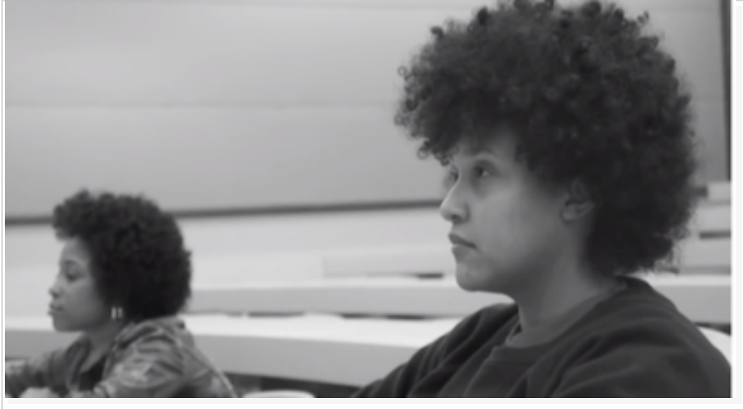
screen shot from 33, School of Law UCLA

The video conveys experiences that are often too difficult to put into words and which academics can have only a peripheral contact with — how racist atmospheres and cultures can build up and take hold in the classroom, the corridors, the cafes and bars. What is unsaid, but which haunts the video, is the long-term emotional and educational costs of such formative experiences.